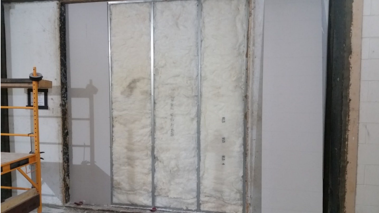
Figure 5 – Insulation installed in stud cavities, receive room side partially installed, viewed from receive room