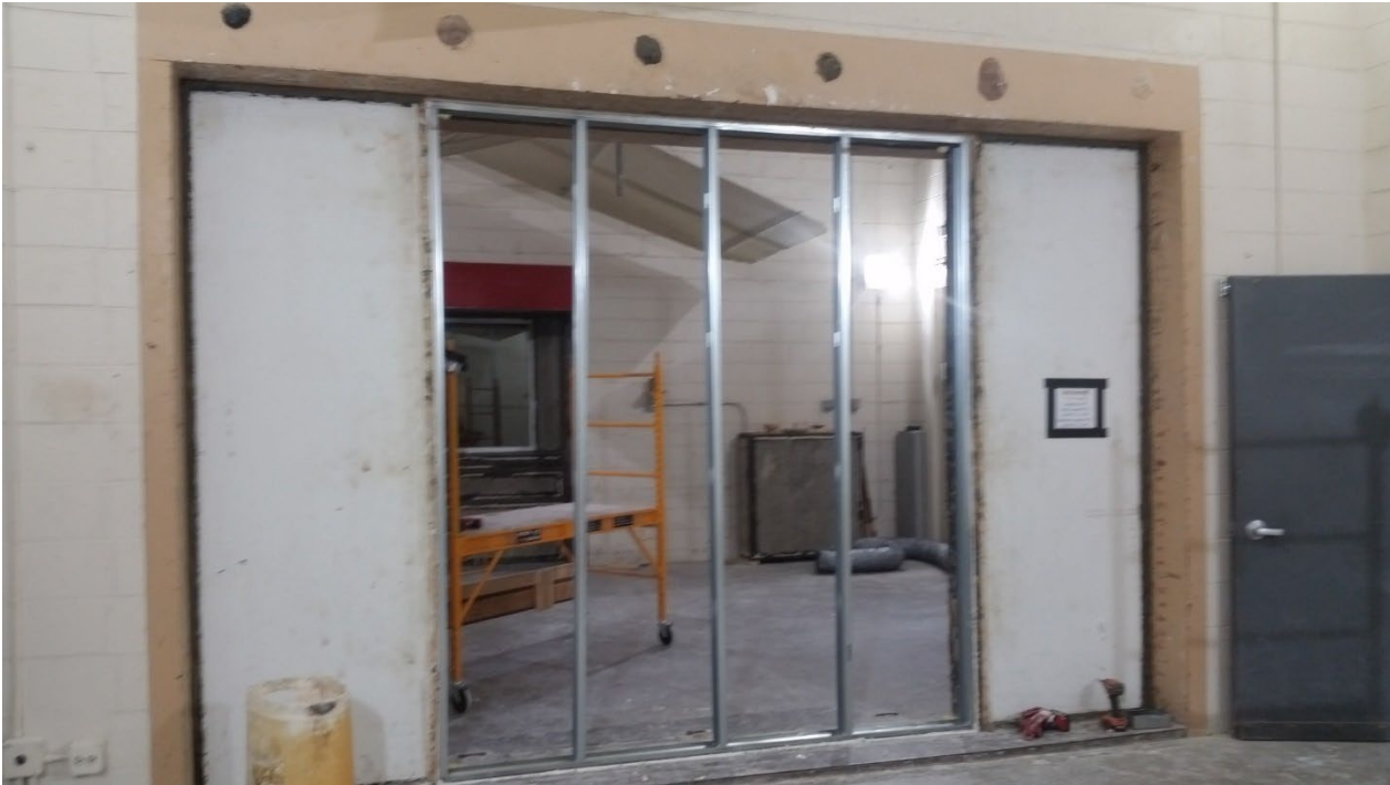
Figure 3 – Tracks and studs installed in test aperture