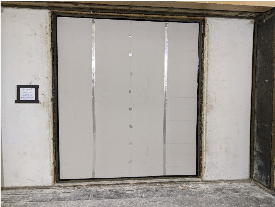
Figure 2 – Specimen mounted in test aperture, as viewed from receive room