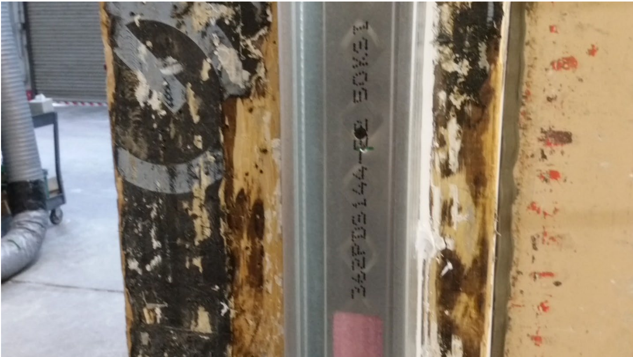
Figure 4 – Detail of side stud fastened to test frame