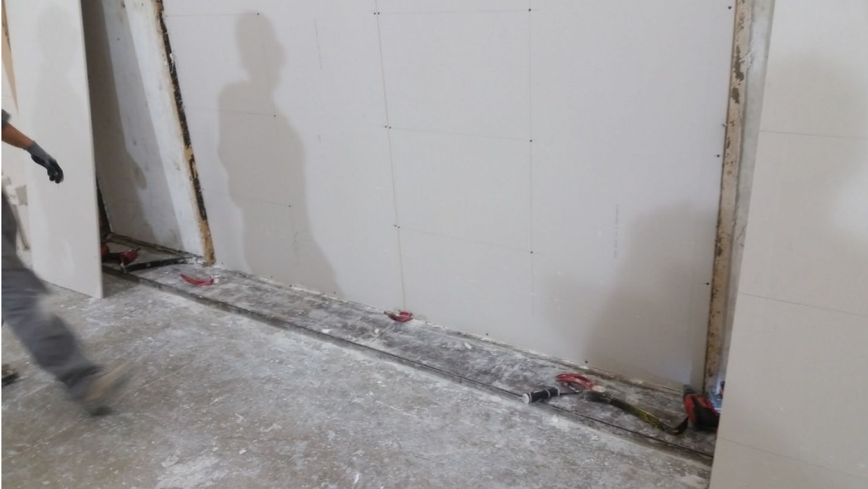
Figure 7 – Source room side base layer gypsum board installed