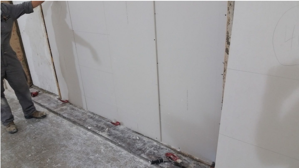
Figure 8 – Source room side face layer gypsum board partially installed