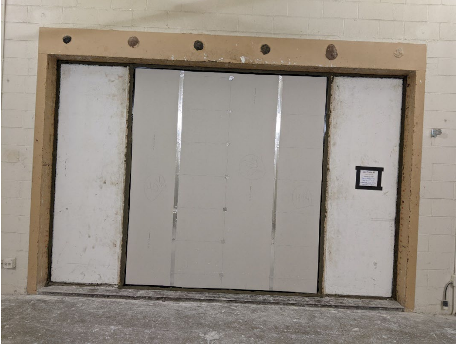
Figure 1 – Specimen mounted in test aperture, as viewed from source room