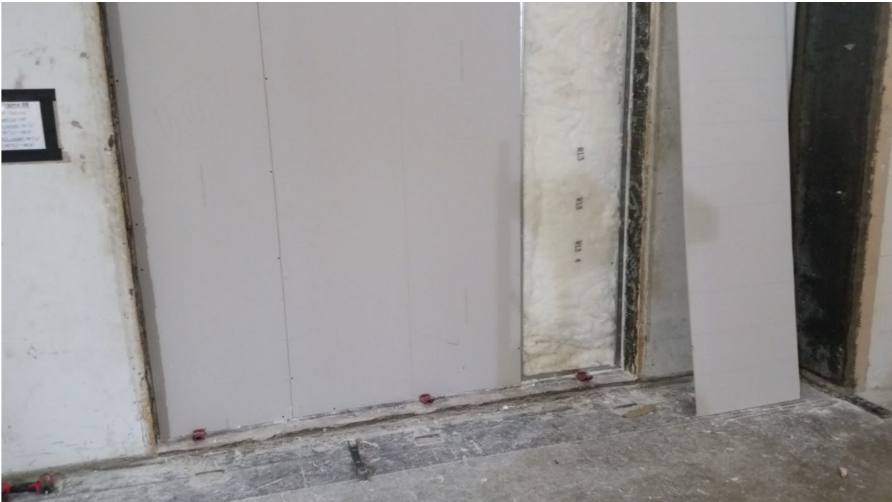
Figure 6 – Insulation installed in stud cavities, receive room side partially installed, viewed from receive room