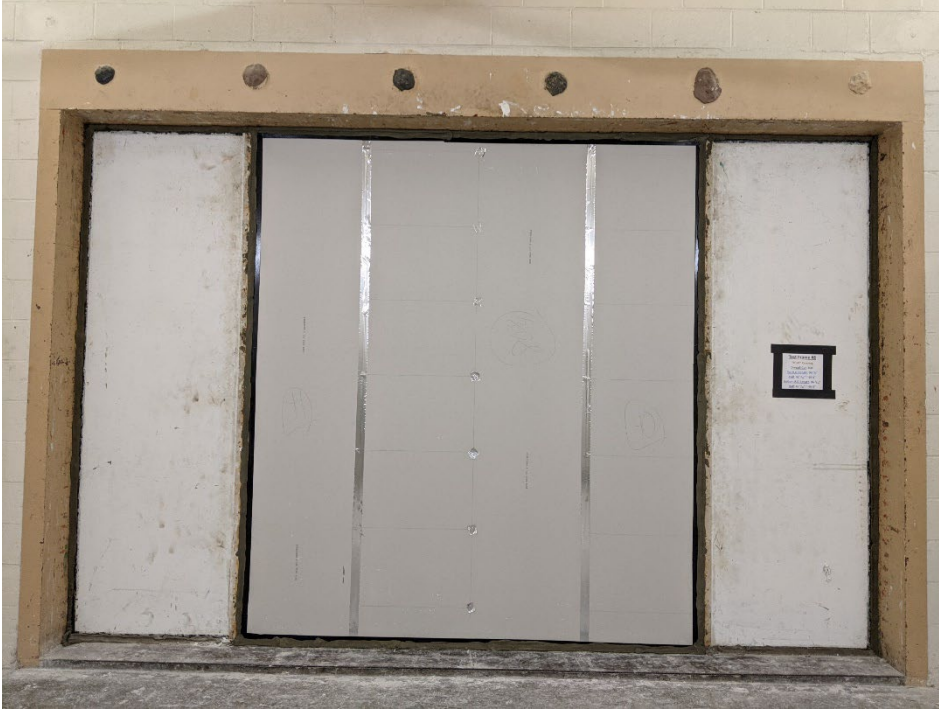
Figure 1 – Specimen mounted in test aperture, as viewed from source room

FOUNDED 1918 BY WALLACE CLEMENT SABINE RAL™-TL24-318 Page 5 of 14