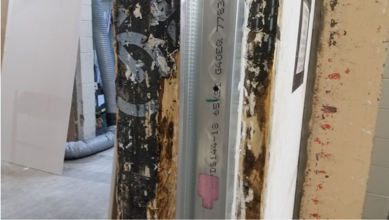
Figure 3 – Detail of side stud fastened to test frame