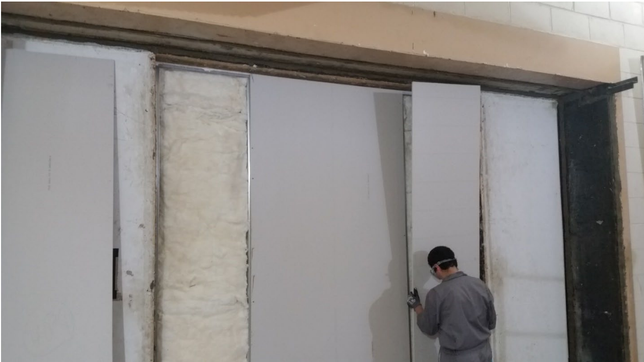
Figure 6 – Receive room side gypsum board partially installed