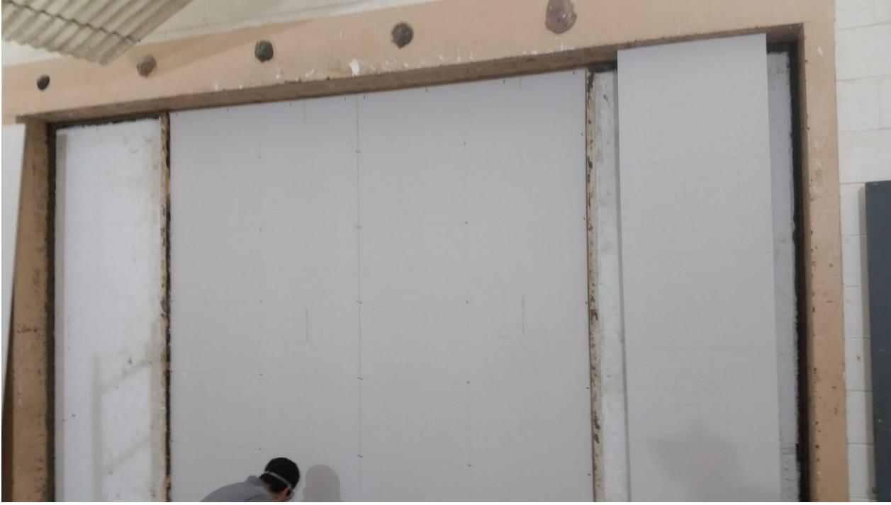
Figure 7 – Source room side base layer gypsum board partially installed