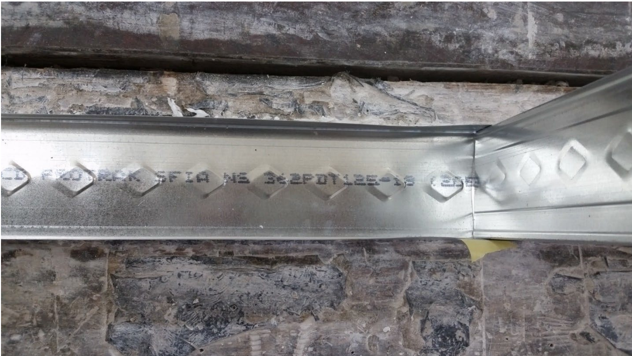
Figure 4 – Detail of stud and track