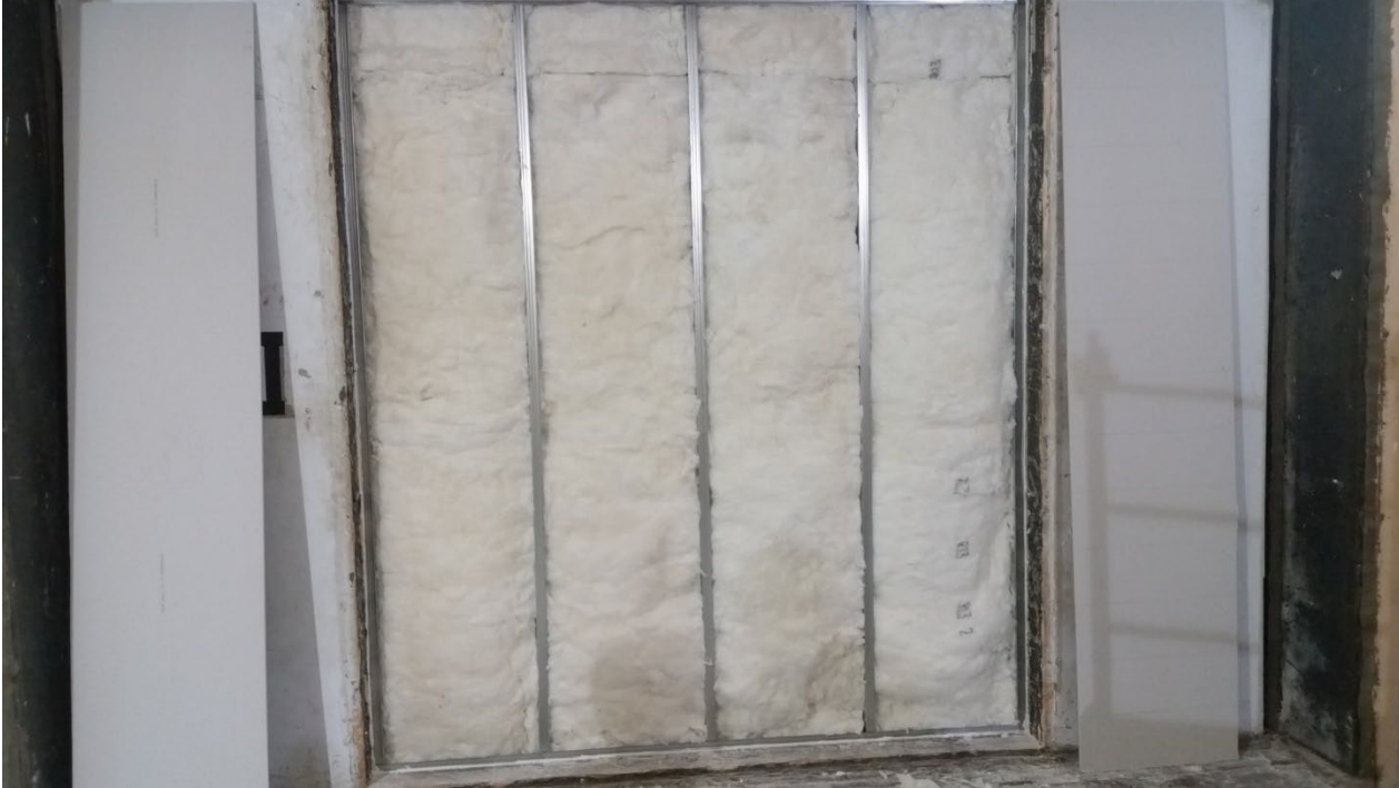
Figure 5 – Insulation installed in stud cavities, viewed from receive room