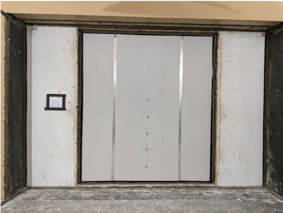
Figure 2 – Specimen mounted in test aperture, as viewed from receive room