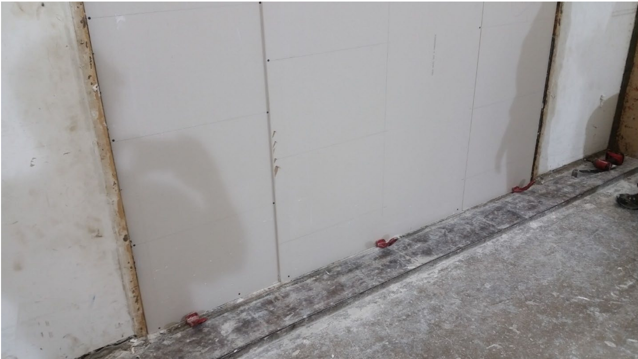
Figure 8 – Source room side face layer gypsum board partially installed