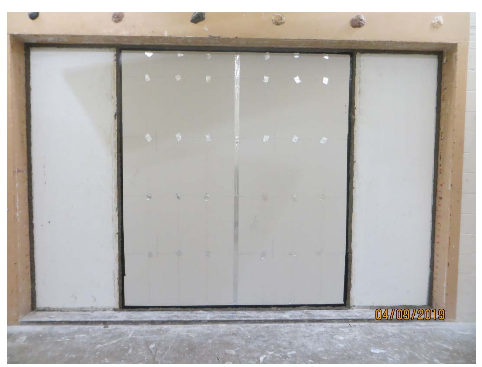
Figure 1 – Specimen mounted in test opening, as viewed from source room