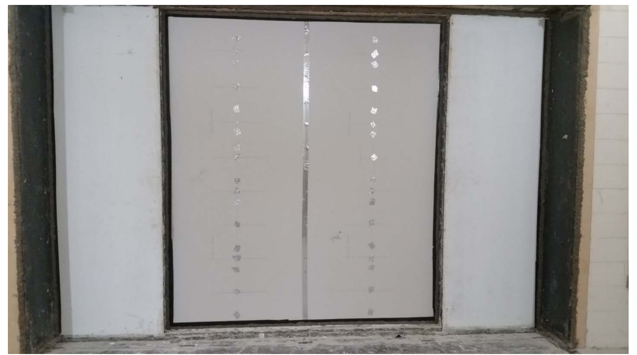
Figure 4 – Screw hole treatments at receive side gypsum board layer