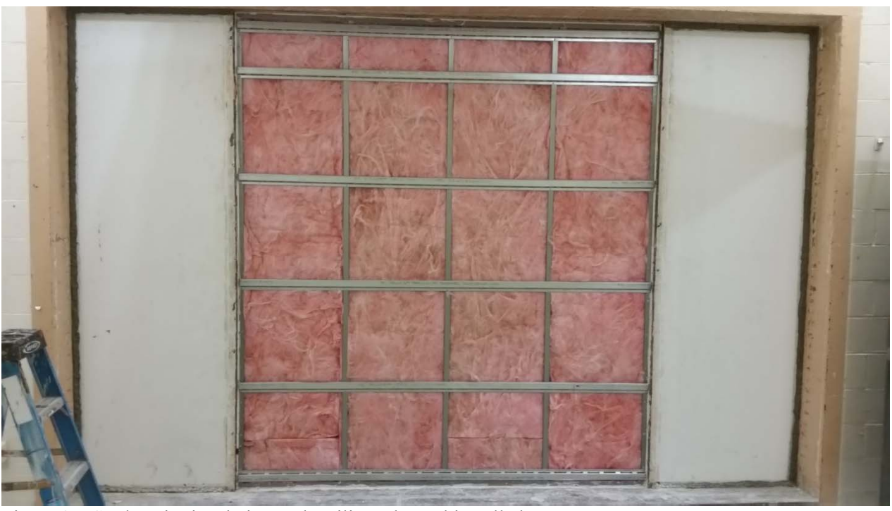
Figure 3 – Stud cavity insulation and resilient channel installed