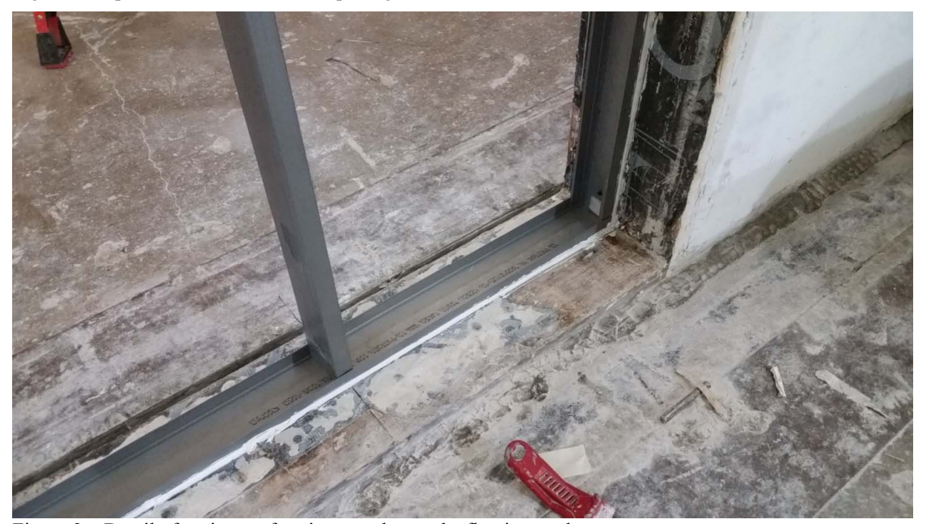
Figure 2 – Detail of perimeter framing member seals, floating studs