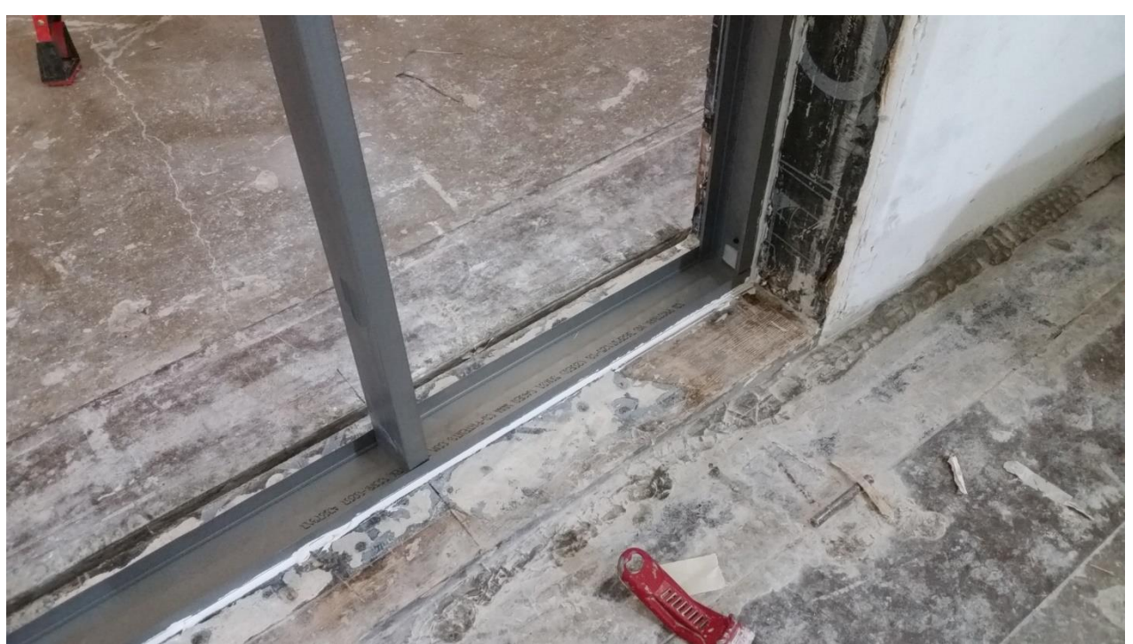
Figure 3 – Typical sealing of perimeter framing members, detail of floating stud