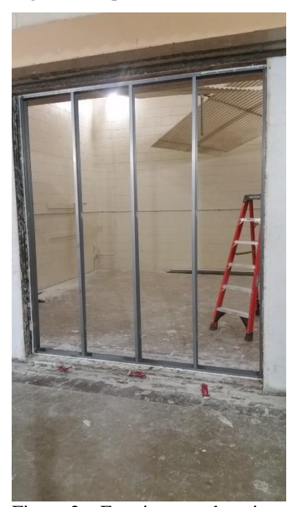
Figure 2 – Framing members installed in test aperture