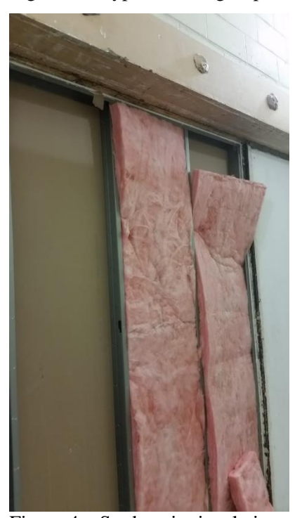
Figure 4 – Stud cavity insulation partially installed