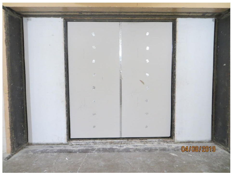
Figure 1 – Specimen mounted in test opening, as viewed from receive room