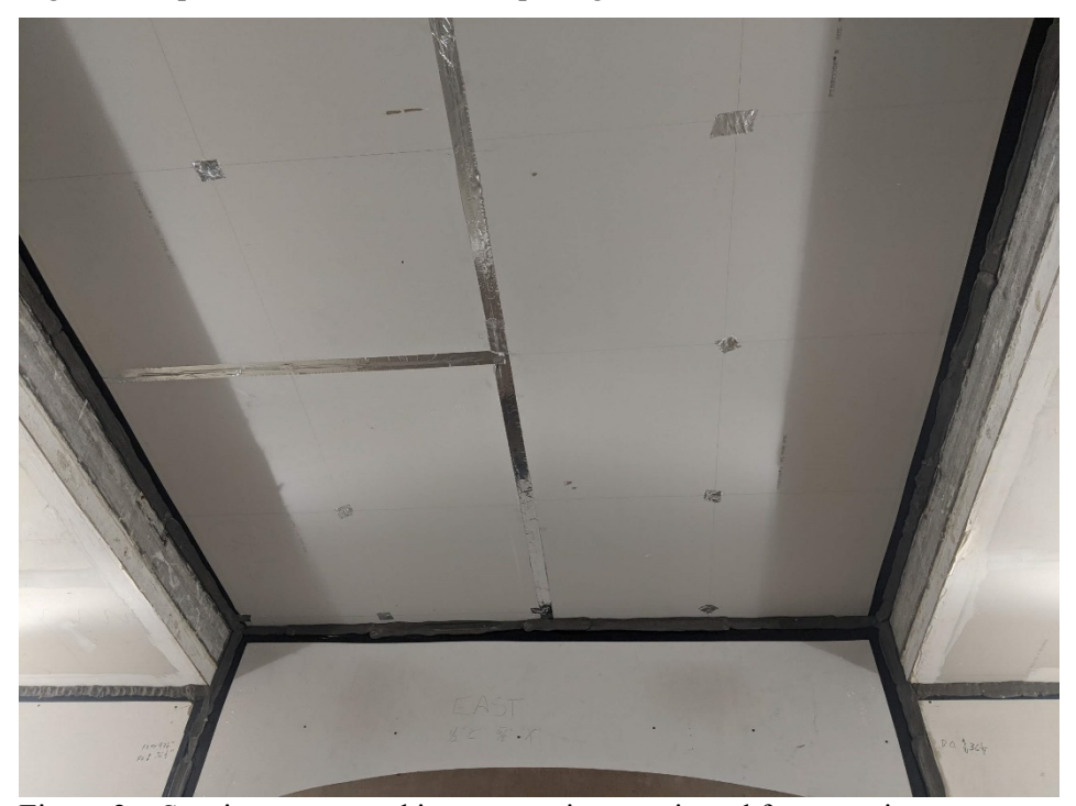
Figure 2 – Specimen mounted in test opening, as viewed from receive room