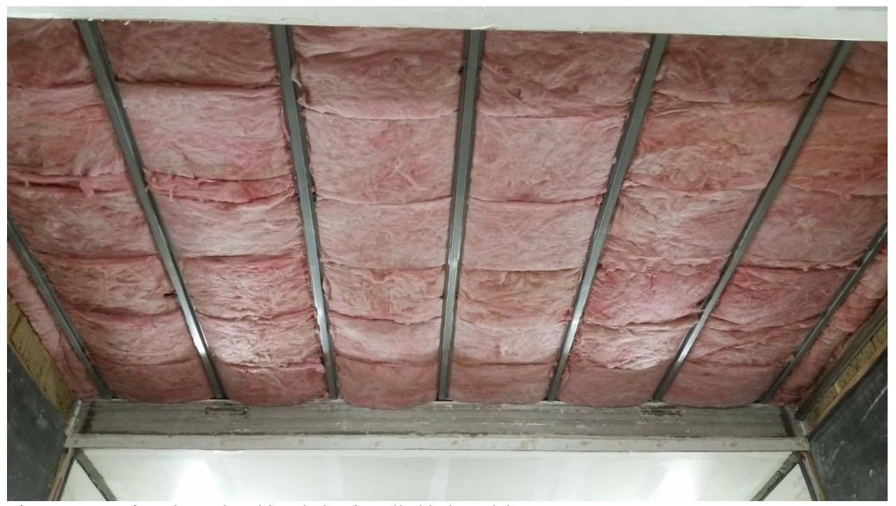
Figure 7 – Furring channel and insulation installed below slabs