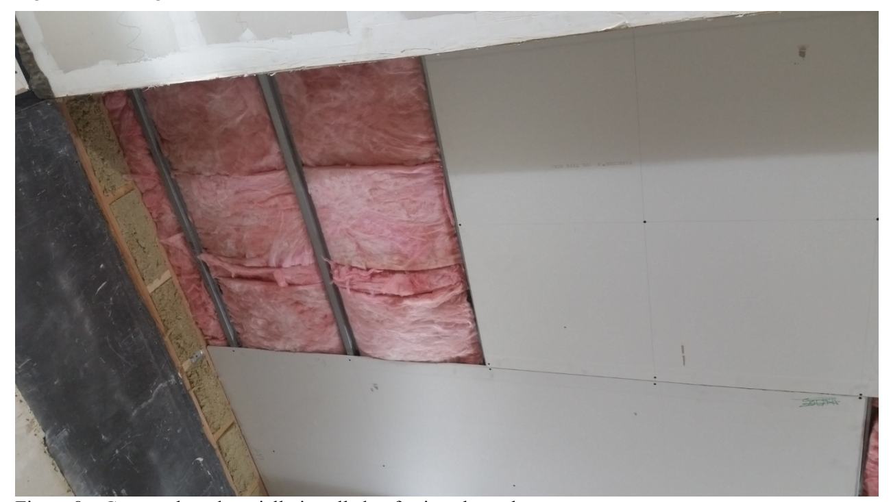
Figure 8 – Gypsum board partially installed to furring channel