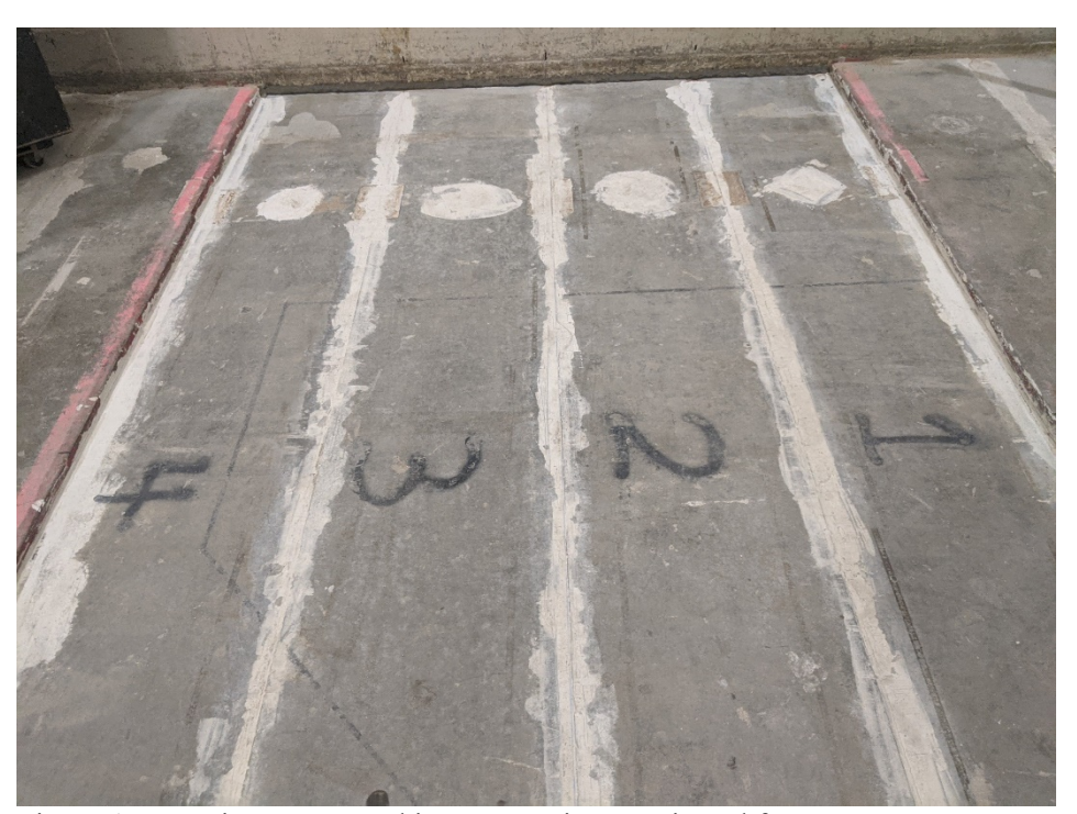
Figure 1 – Specimen mounted in test opening, as viewed from source room