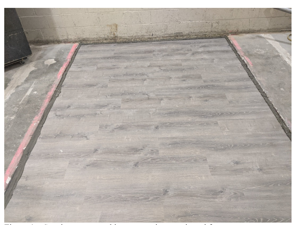
Figure 1 – Specimen mounted in test opening, as viewed from source room