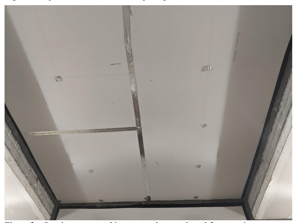
Figure 2 – Specimen mounted in test opening, as viewed from receive room