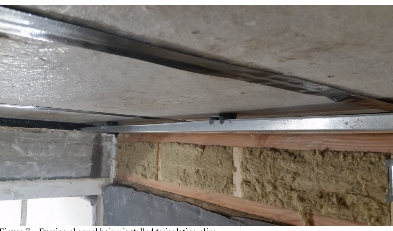
Figure 7 – Furring channel being installed to isolating clips