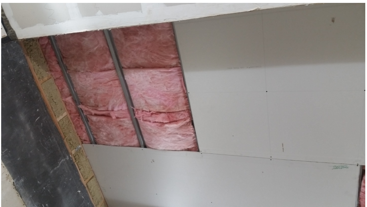
Figure 9 – Gypsum board partially installed to furring channel