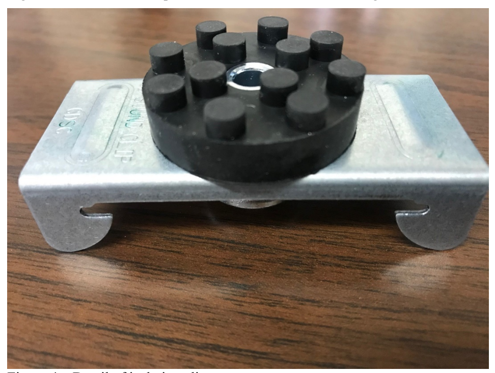
Figure 4 – Detail of isolating clip