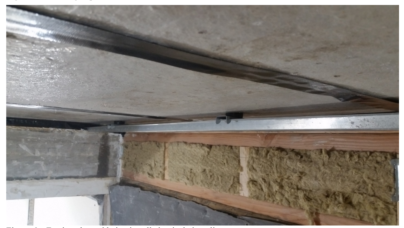
Figure 6 – Furring channel being installed to isolating clips