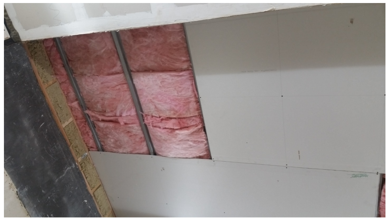
Figure 8 – First layer of gypsum board partially installed to furring channel