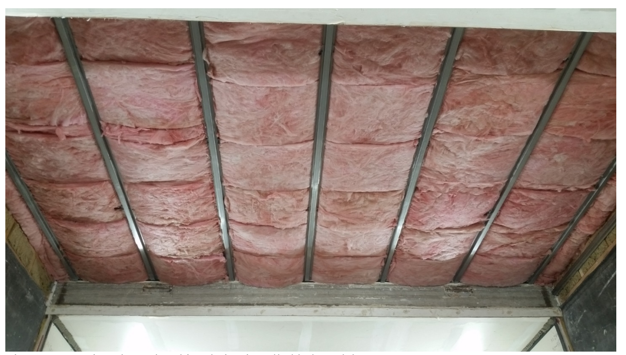
Figure 7 – Furring channel and insulation installed below slabs