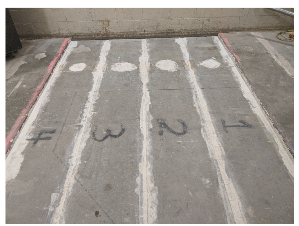
Figure 1 – Specimen mounted in test opening, as viewed from source room