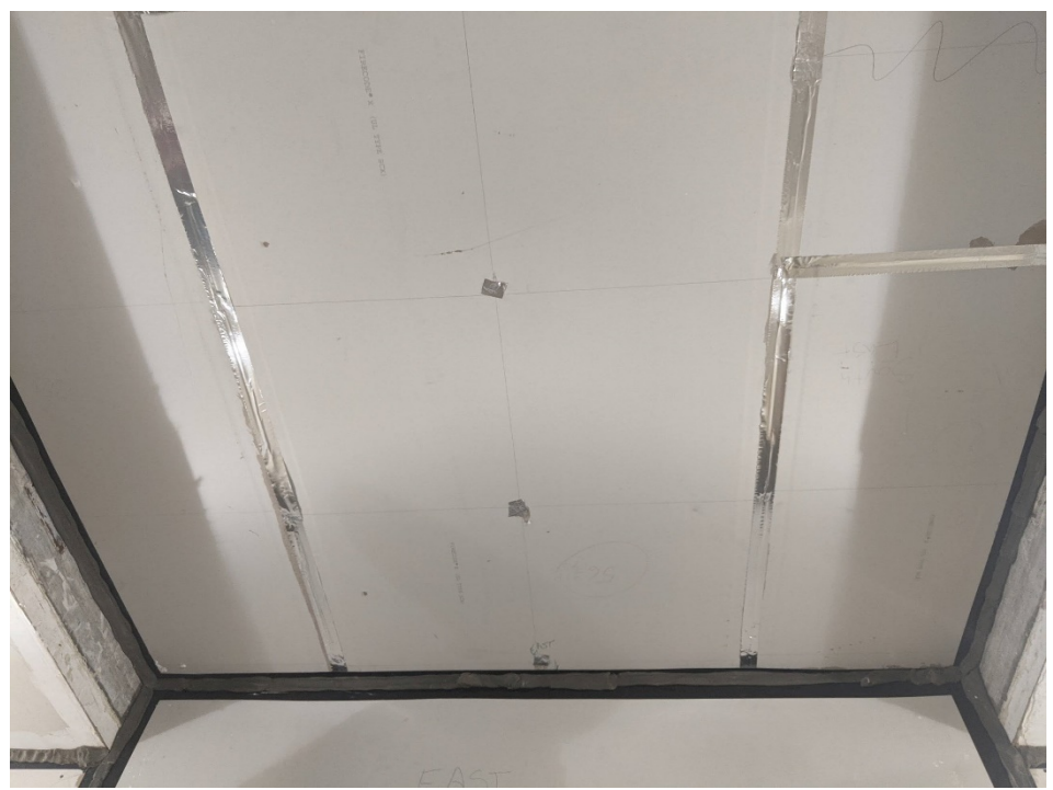
Figure 2 – Specimen mounted in test opening, as viewed from receive room