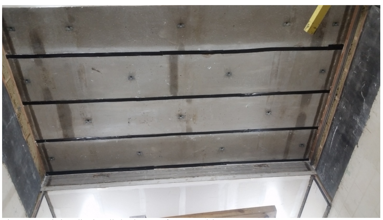
Figure 5 – Isolating clips installed to bottom of concrete slabs