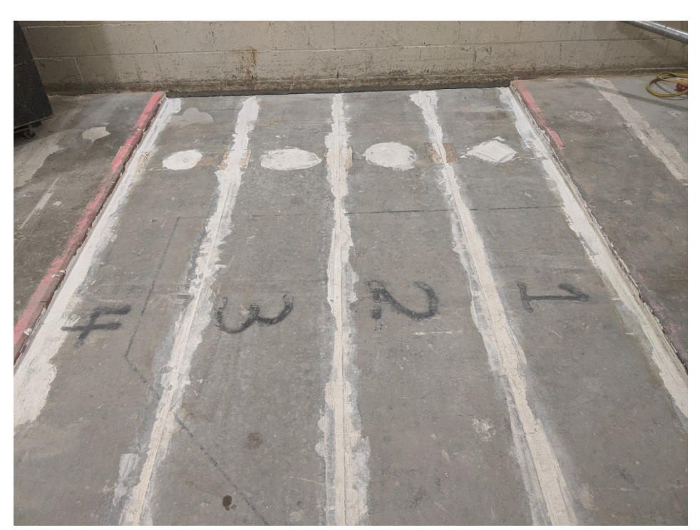
Figure 3 – Concrete slabs prior to installation of flooring, viewed from source room