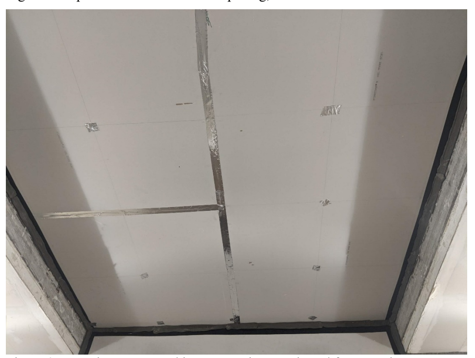
Figure 2 – Specimen mounted in test opening, as viewed from receive room