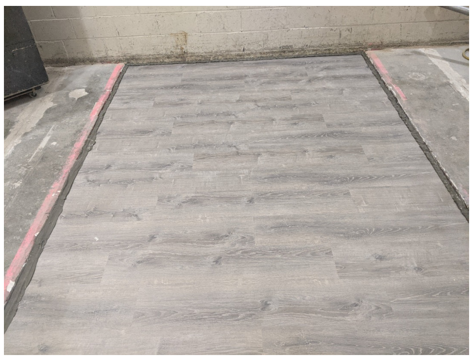
Figure 1 – Specimen mounted in test opening, as viewed from source room