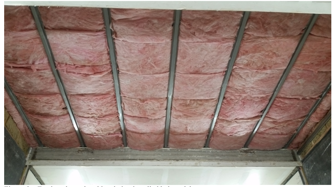
Figure 8 – Furring channel and insulation installed below slabs