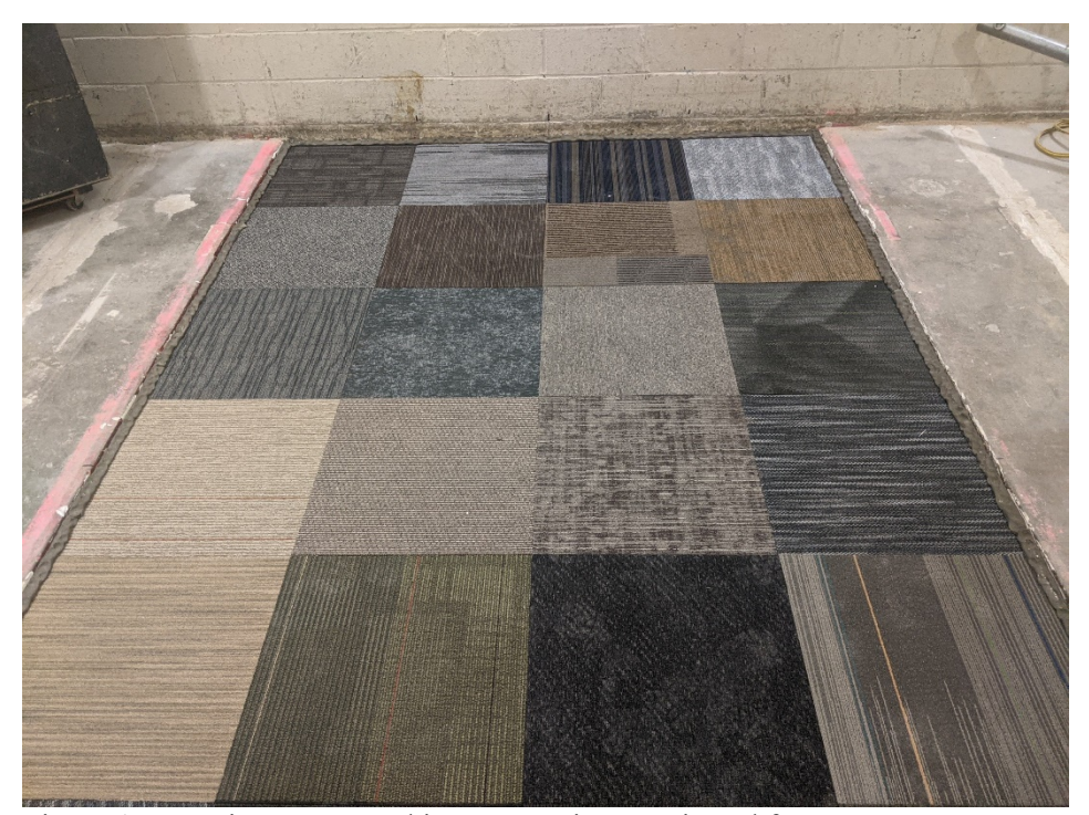
Figure 1 – Specimen mounted in test opening, as viewed from source room