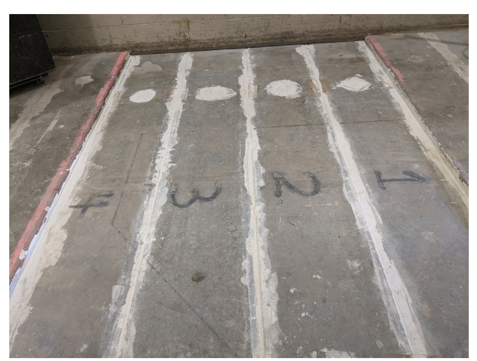
Figure 3 – Concrete slabs prior to installation of carpet flooring, viewed from source room