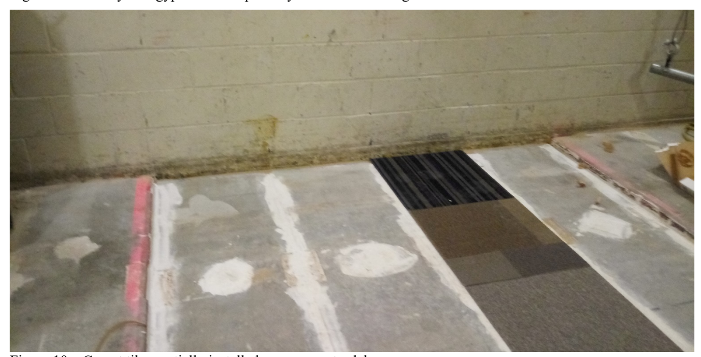
Figure 10 – Carpet tiles partially installed over concrete slabs