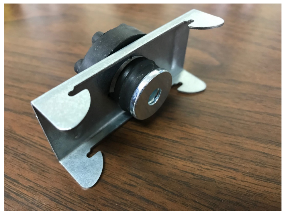
Figure 5 – Detail of isolating clip