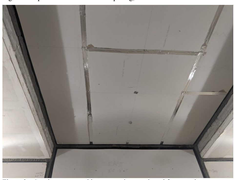
Figure 2 – Specimen mounted in test opening, as viewed from receive room