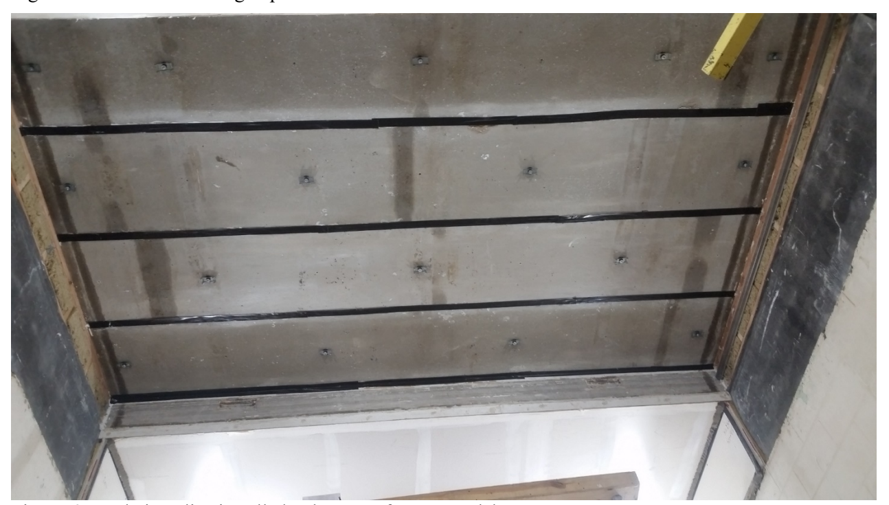
Figure 6 – Isolating clips installed to bottom of concrete slabs