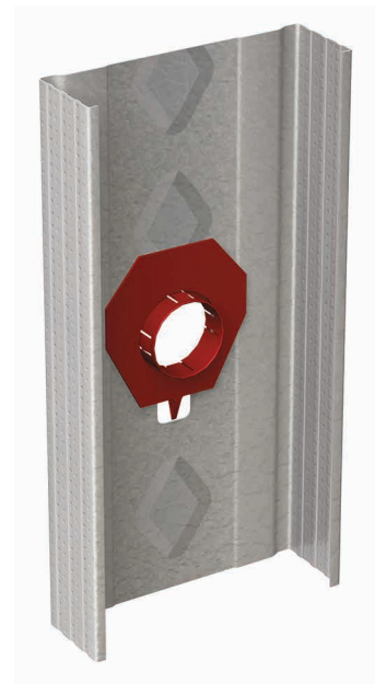
Grommet for 3-1/2" and Wider Studs