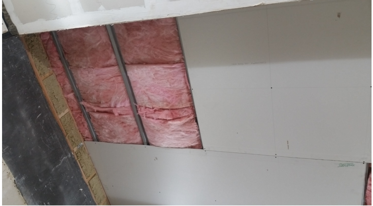
Figure 9 – First layer of gypsum board partially installed to furring channel