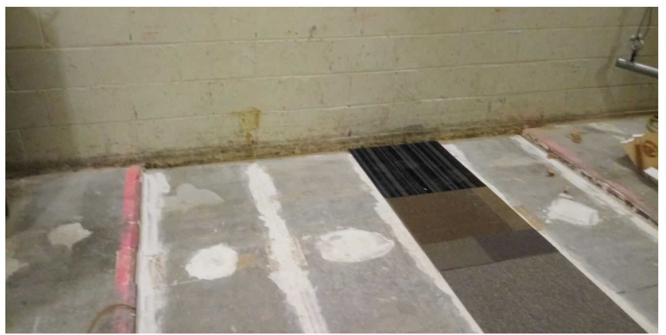
Figure 10 - Carpet tiles partially installed over concrete slabs