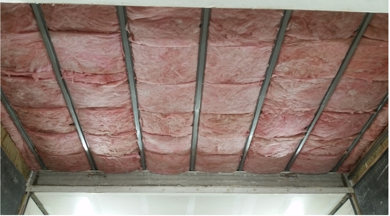
Figure 8 – Furring channel and insulation installed below slabs