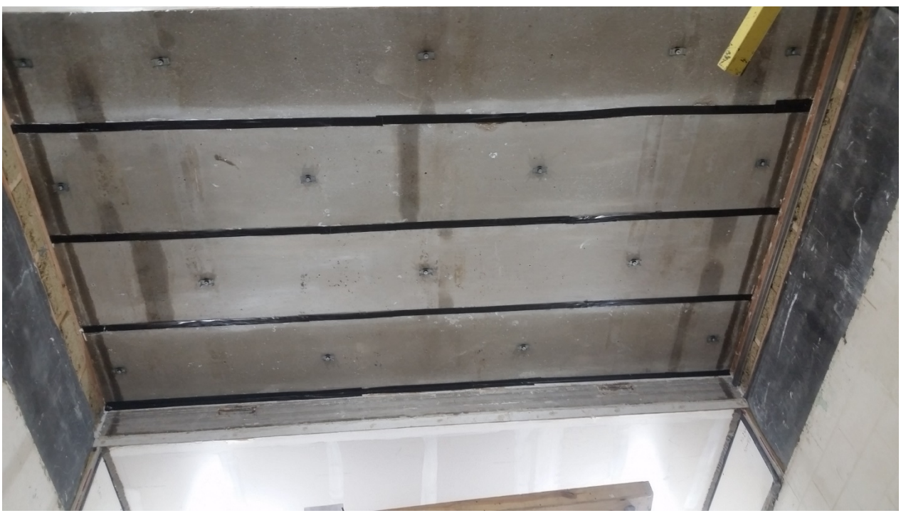
Figure 6 – Isolating clips installed to bottom of concrete slabs