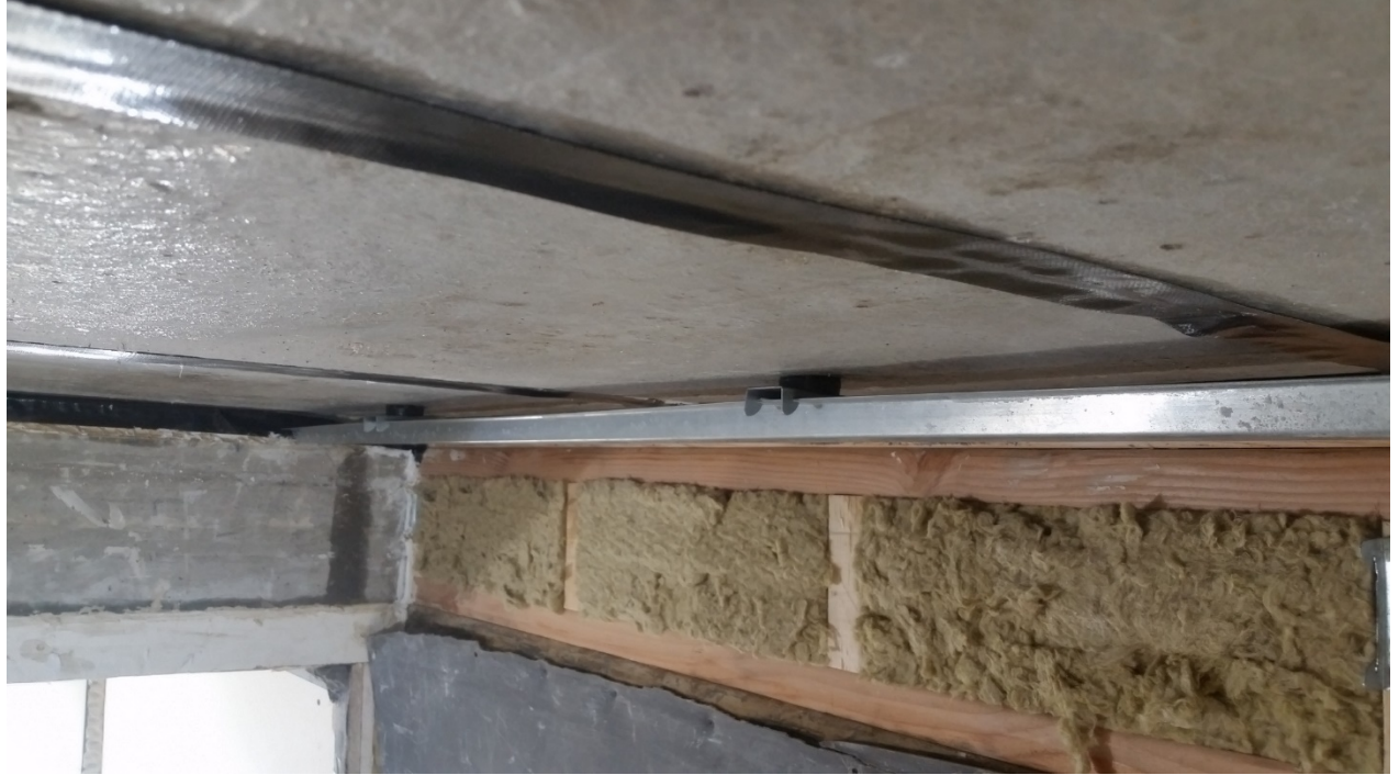
Figure 7 – Furring channel being installed to isolating clips