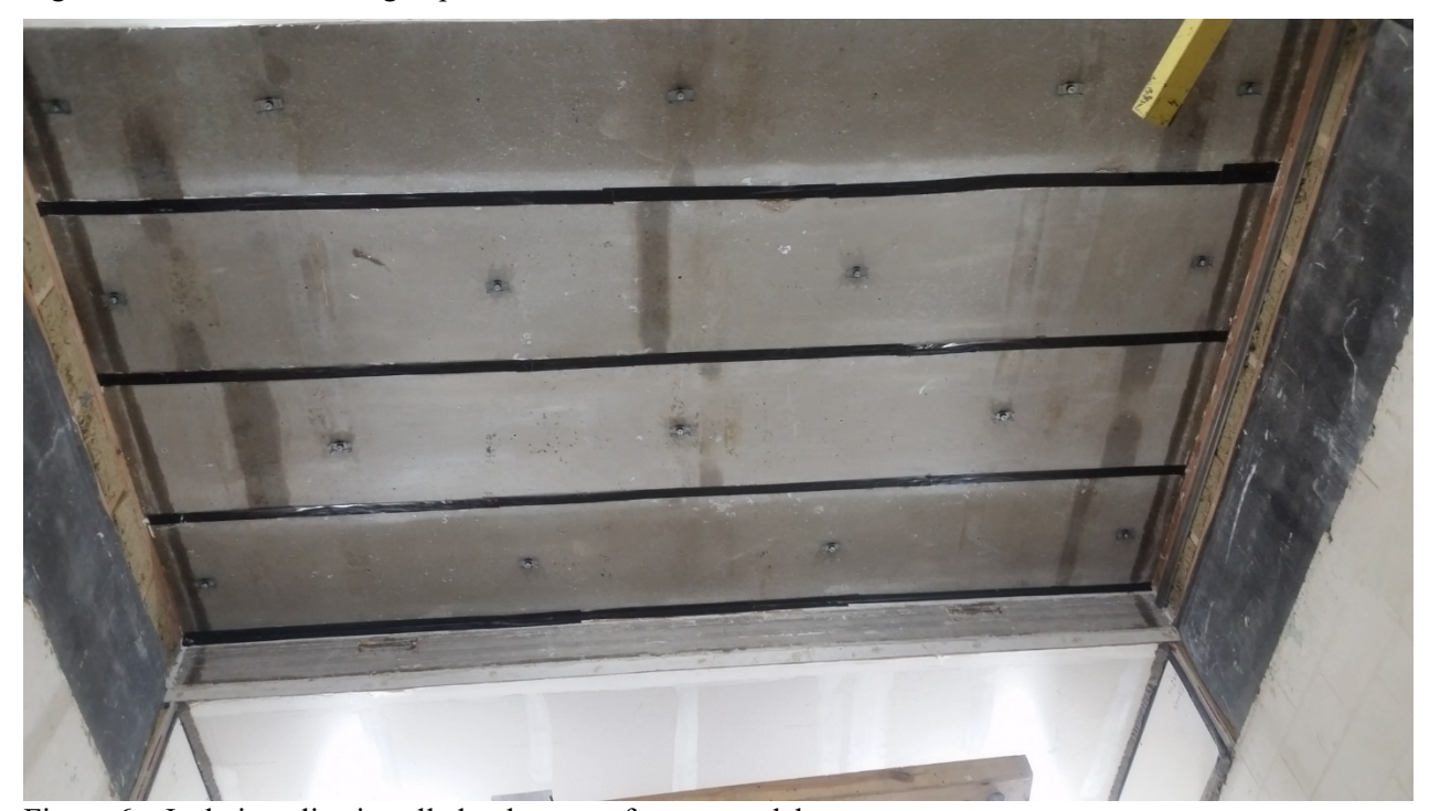
Figure 6 – Isolating clips installed to bottom of concrete slabs