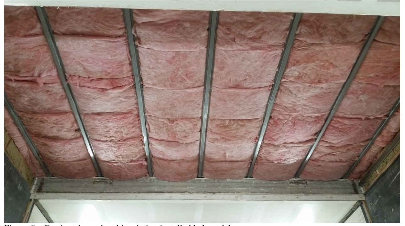
Figure 8 – Furring channel and insulation installed below slabs