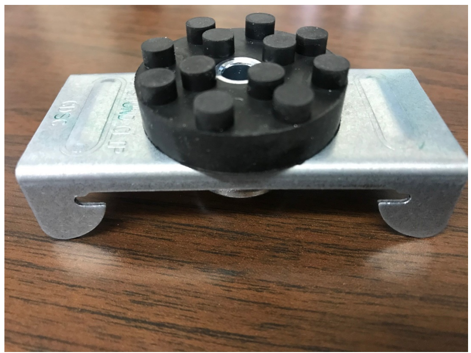
Figure 4 – Detail of isolating clip