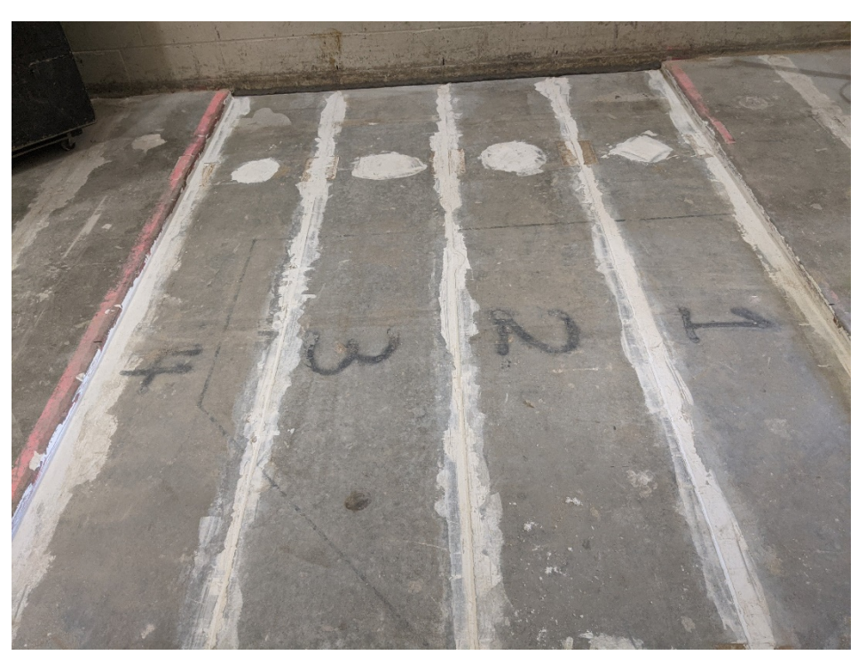
Figure 3 – Concrete slabs prior to installation of flooring, viewed from source room