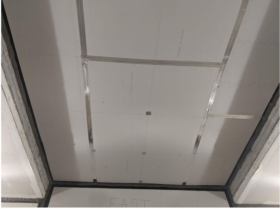
Figure 2 – Specimen mounted in test opening, as viewed from receive room