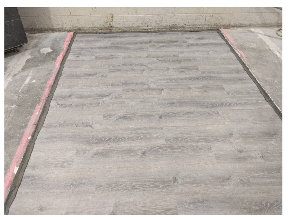
Figure 1 – Specimen mounted in test opening, as viewed from source room