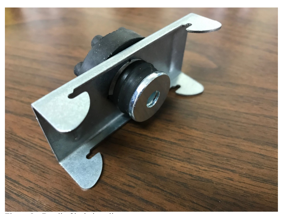
Figure 5 – Detail of isolating clip