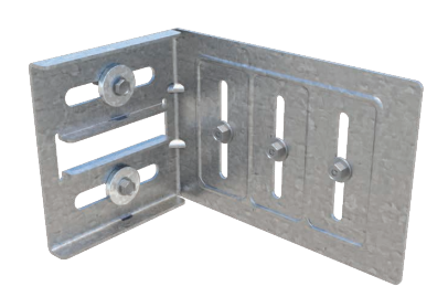
STRUCTURE CENTER CONNECTION ' Drift Bushings centered in slots

Attachment to the primary structure can be made with screws, or bolt anchors. Structure attachments shall be driven through the drift bushings and the Drift FastClip ^{TM} - centered in the drift slots.