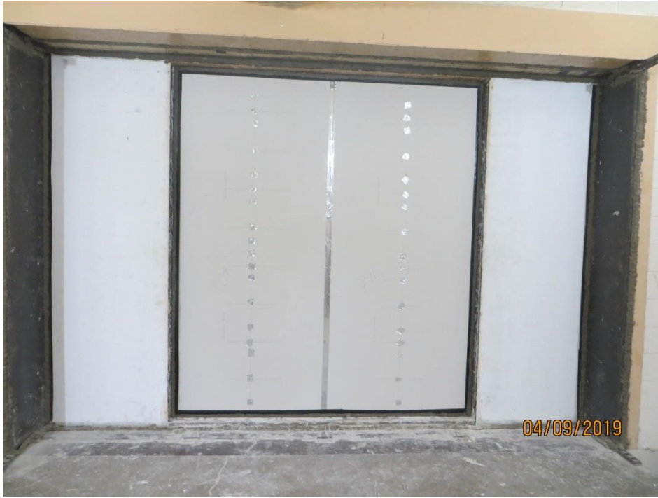
Figure 1 – Specimen mounted in test opening, as viewed from receive room