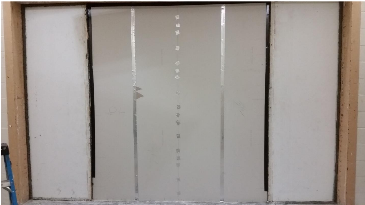
Figure 4 – Screw hole treatment method, as viewed from source room