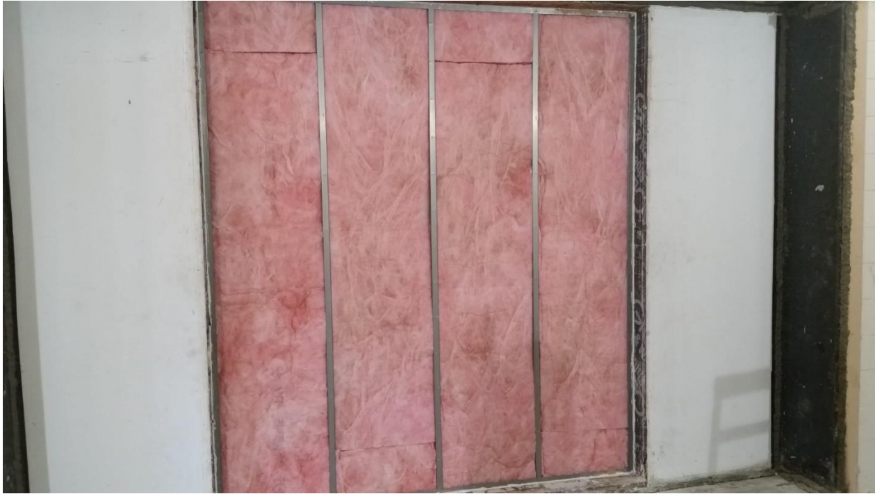
Figure 3 – Stud cavity insulation installed