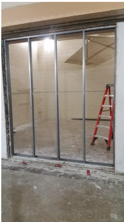
Figure 2 – Framing members installed in test aperture