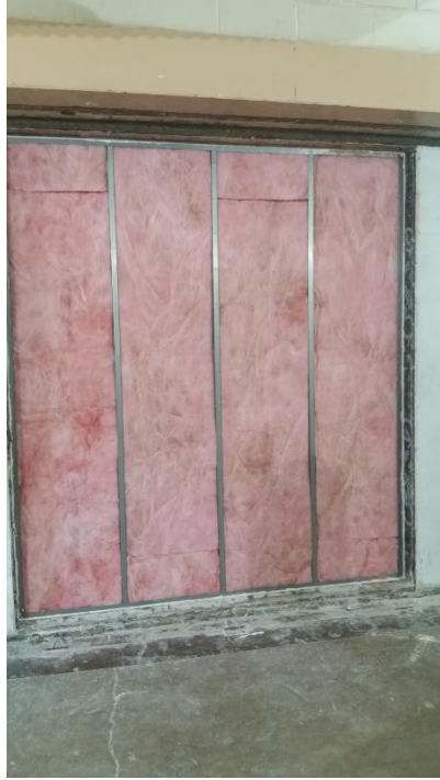
Figure 3 – Stud cavity insulation installed