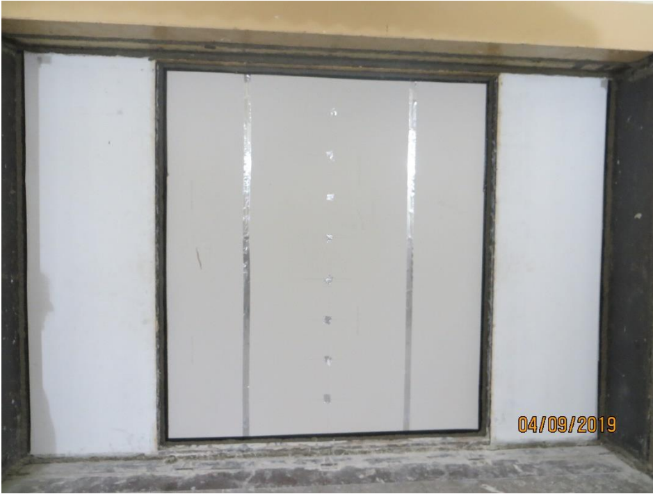
Figure 1 – Specimen mounted in test opening, as viewed from receive room