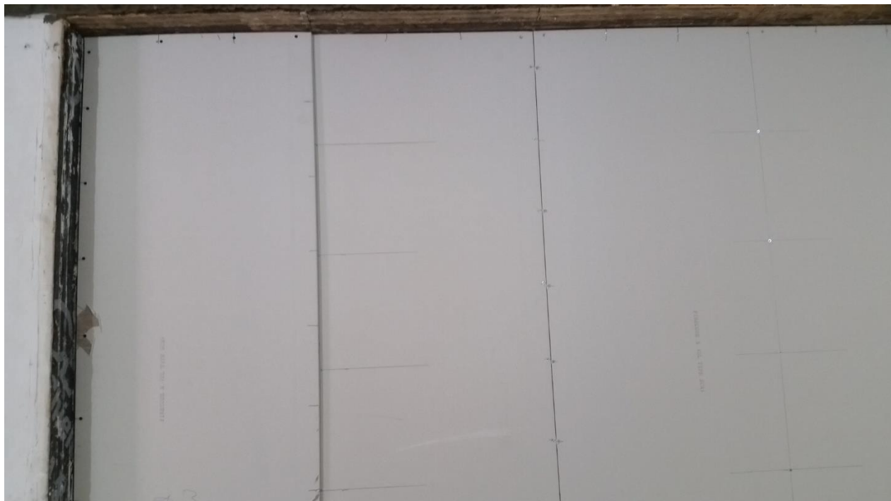
Figure 4 – Gypsum board layer partially installed over existing gypsum board layer