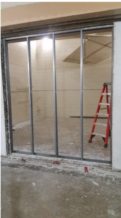
Figure 2 – Framing members installed in test aperture