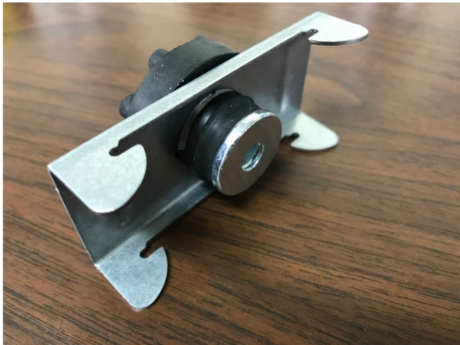
Figure 5 – Detail of isolating clip