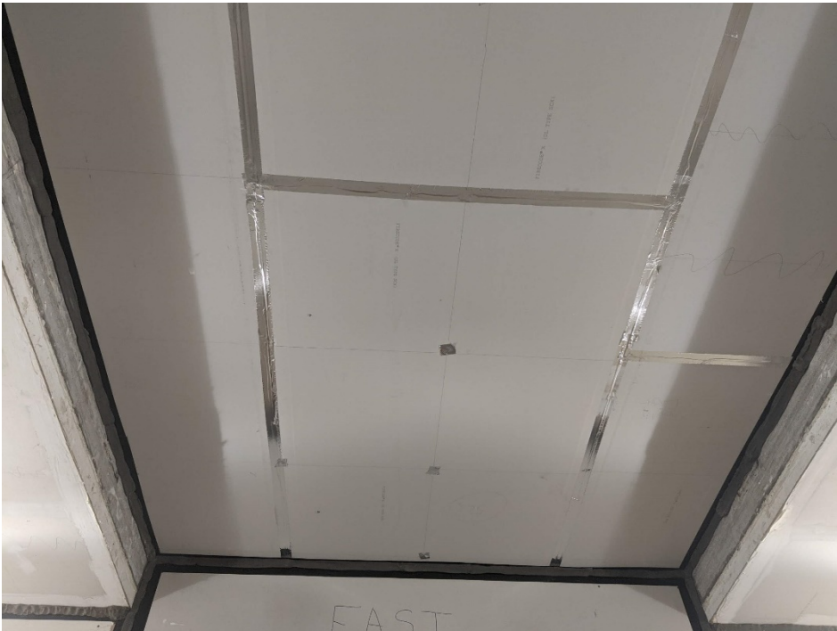
Figure 2 – Specimen mounted in test opening, as viewed from receive room