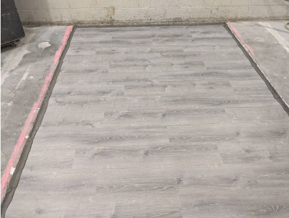
Figure 1 – Specimen mounted in test opening, as viewed from source room