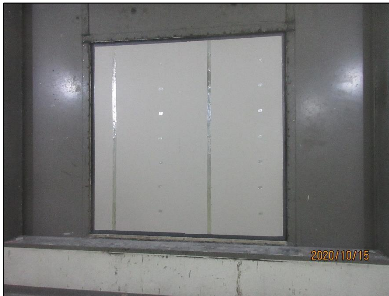
Photo No. 1 Receive Room View of Installed Specimen