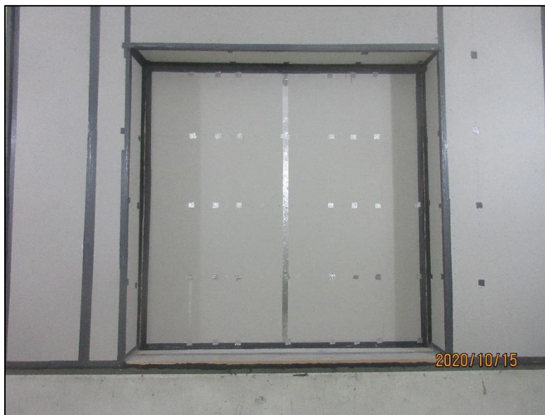
Photo No. 2 Source Room View of Installed Specimen