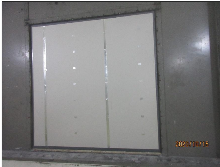
Photo No. 1 Receive Room View of Installed Specimen