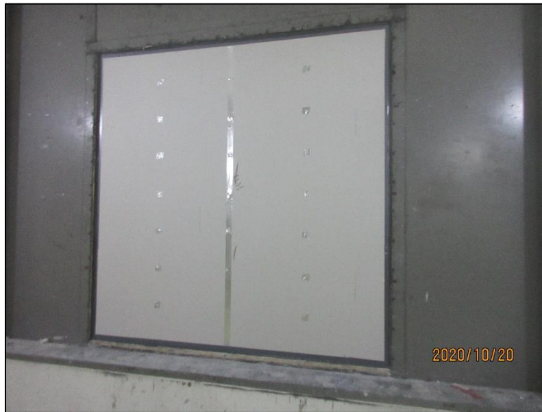
Photo No. 1 Receive Room View of Installed Specimen