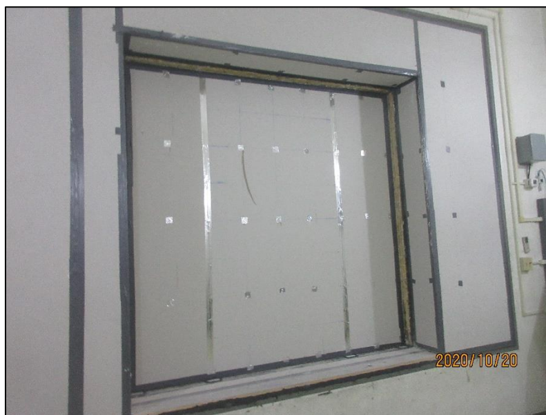
Photo No. 2 Source Room View of Installed Specimen