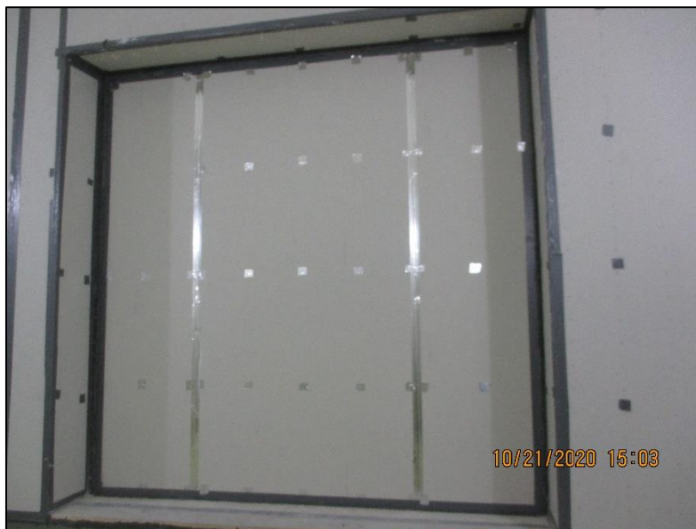
Photo No. 2 Source Room View of Installed Specimen