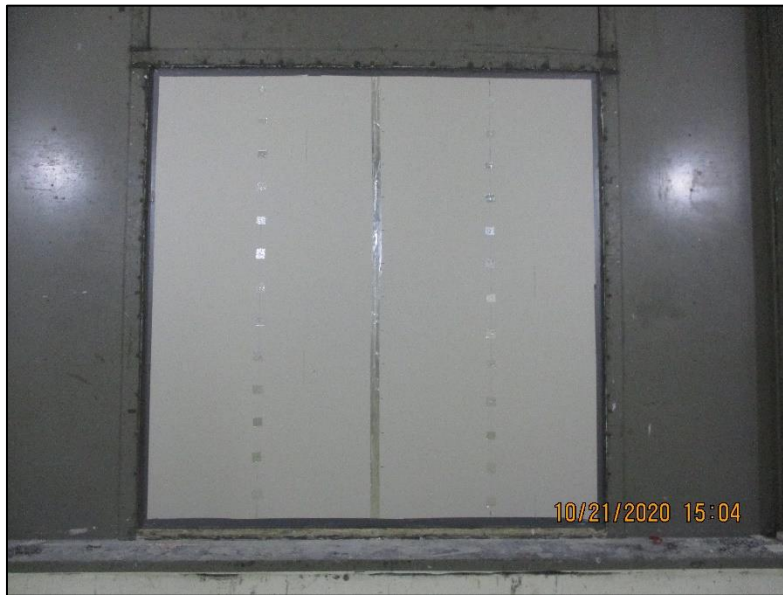
Photo No. 1 Receive Room View of Installed Specimen