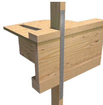
Rolled Strap Installation