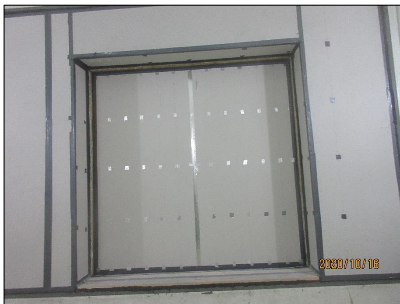
Photo No. 2 Source Room View of Installed Specimen