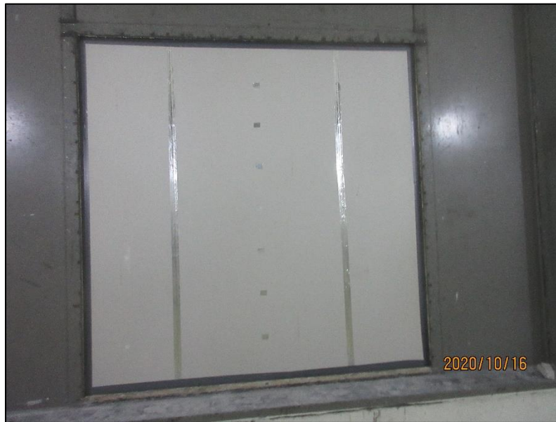
Photo No. 1 Receive Room View of Installed Specimen