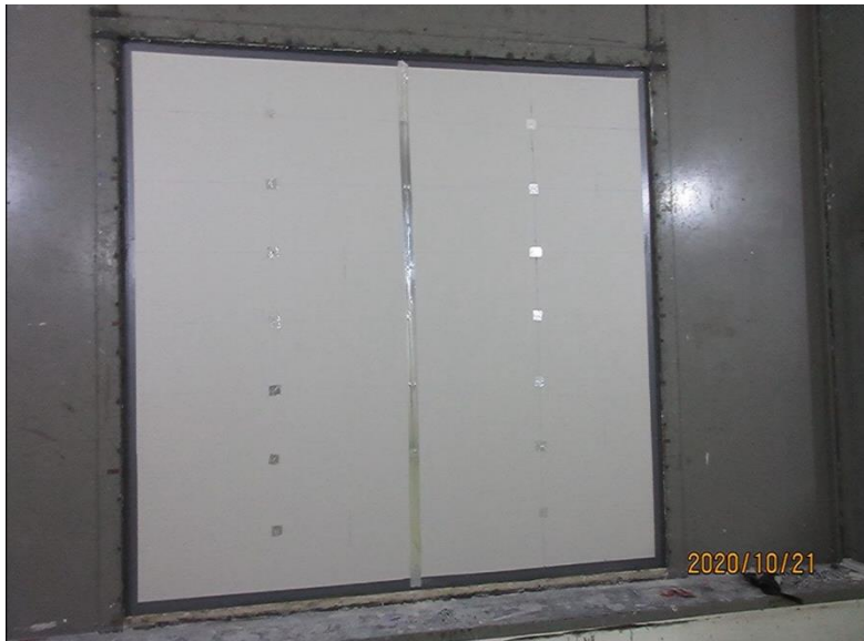
Photo No. 1 Receive Room View of Installed Specimen