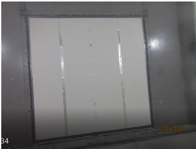
Photo No. 2 Source Room View of Installed Specimen