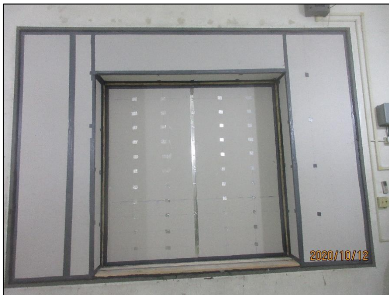
Photo No. 2 Source Room View of Installed Specimen