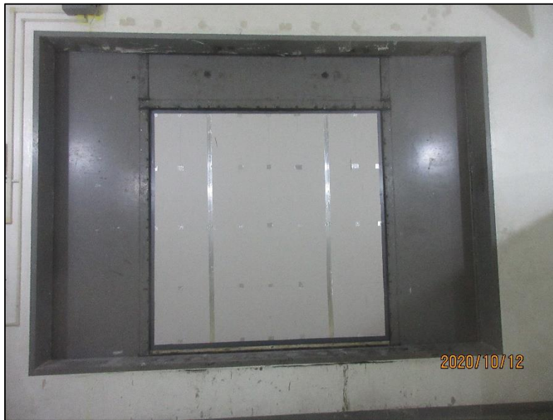
Photo No. 1 Receive Room View of Installed Specimen