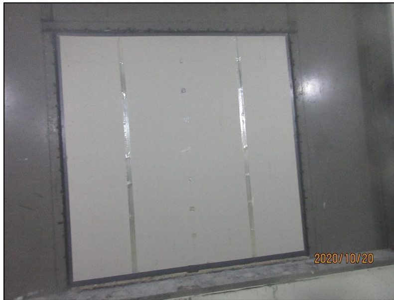
Photo No. 1 Receive Room View of Installed Specimen