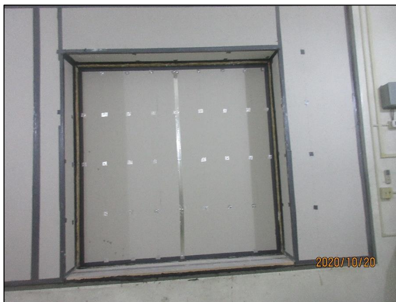
Photo No. 2 Source Room View of Installed Specimen