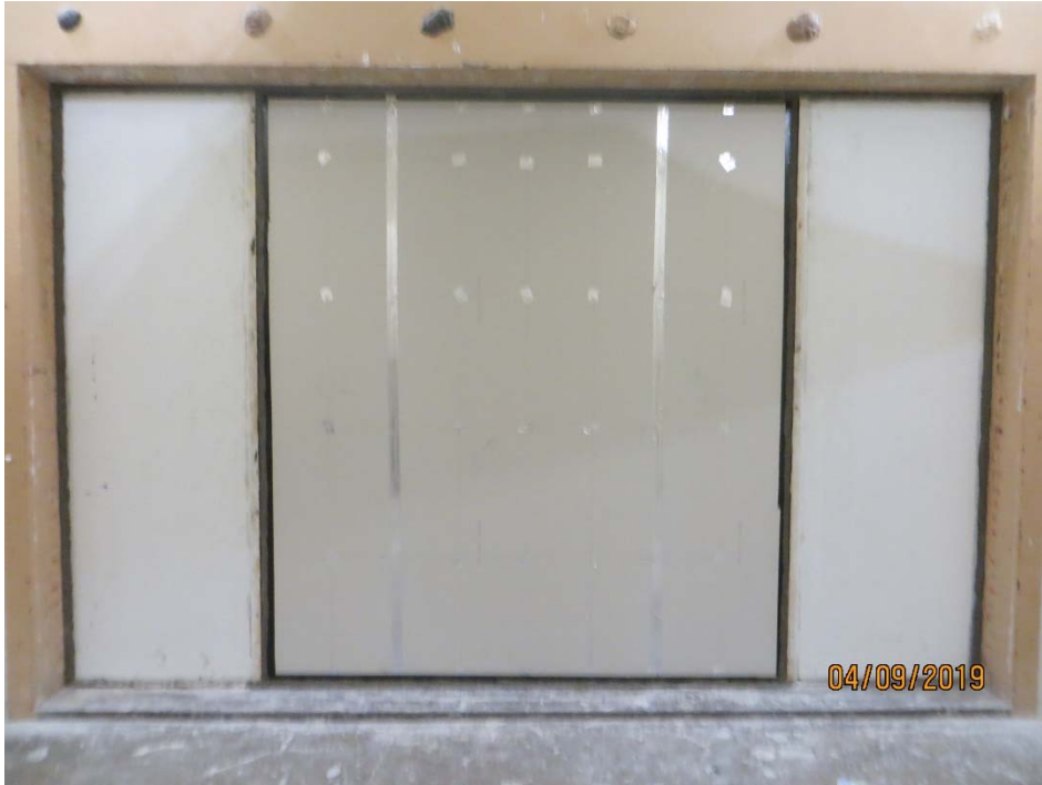
Figure 1 – Specimen mounted in test opening, as viewed from source room