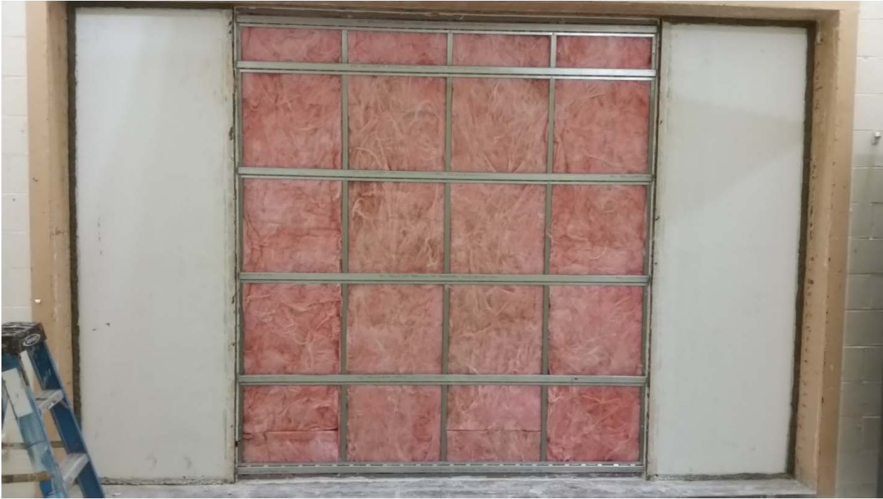
Figure 3 – Stud cavity insulation and resilient channel installed