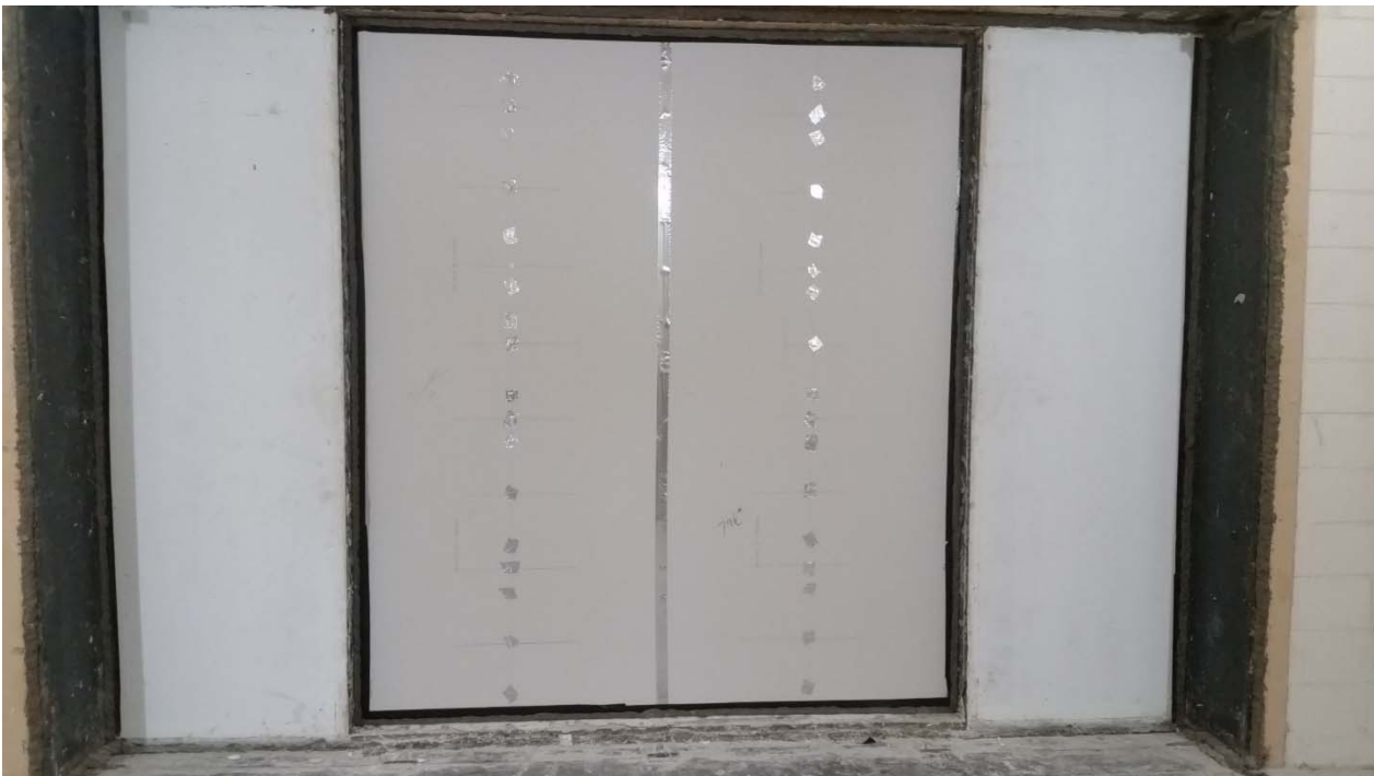
Figure 4 – Screw hole treatment at receive room gypsum board layer