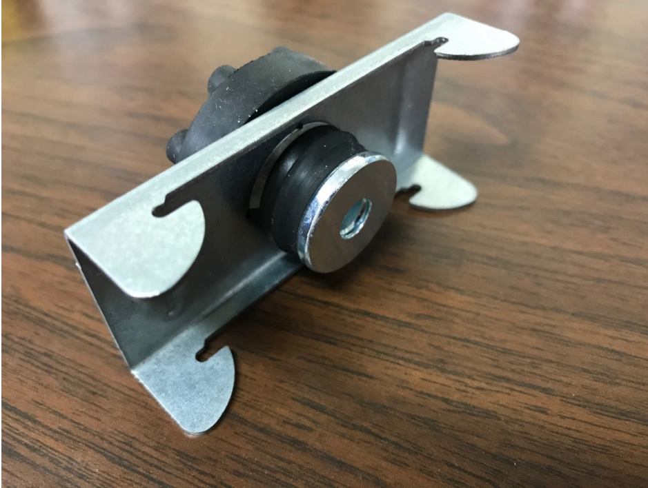
Figure 5 – Detail of isolating clip