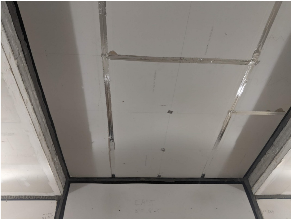
Figure 2 – Specimen mounted in test opening, as viewed from receive room