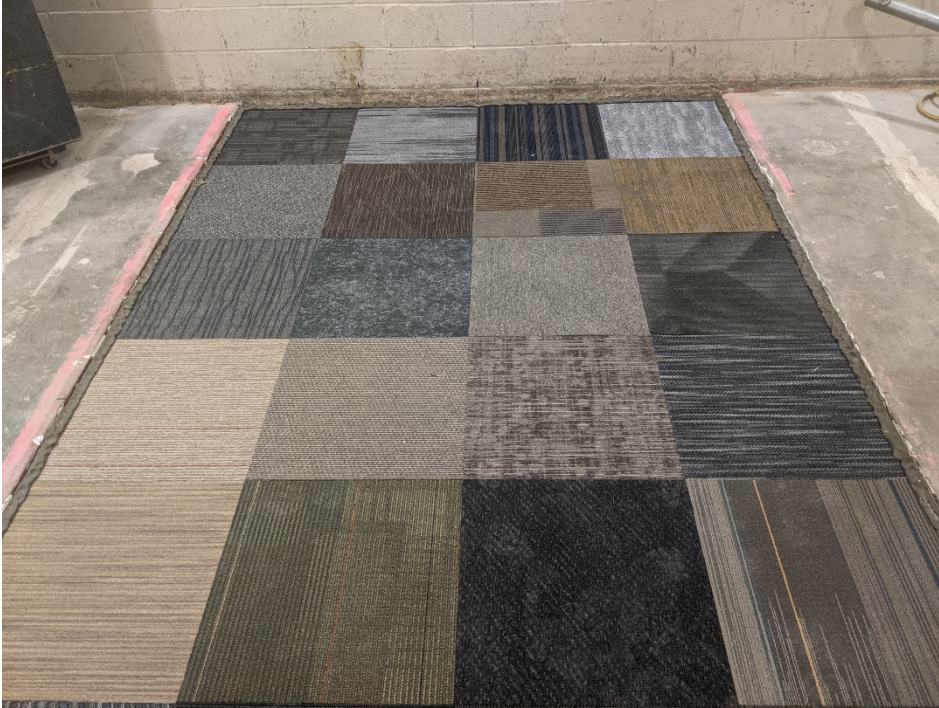
Figure 1 – Specimen mounted in test opening, as viewed from source room