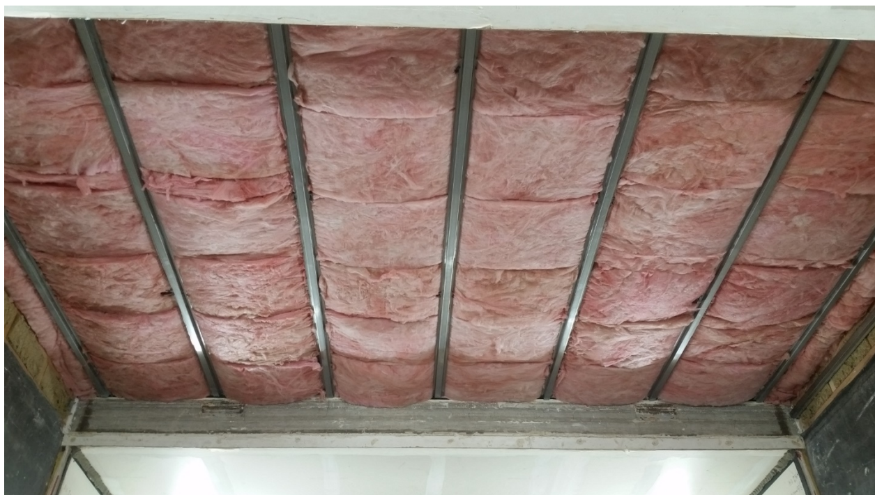
Figure 8 – Furring channel and insulation installed below slabs