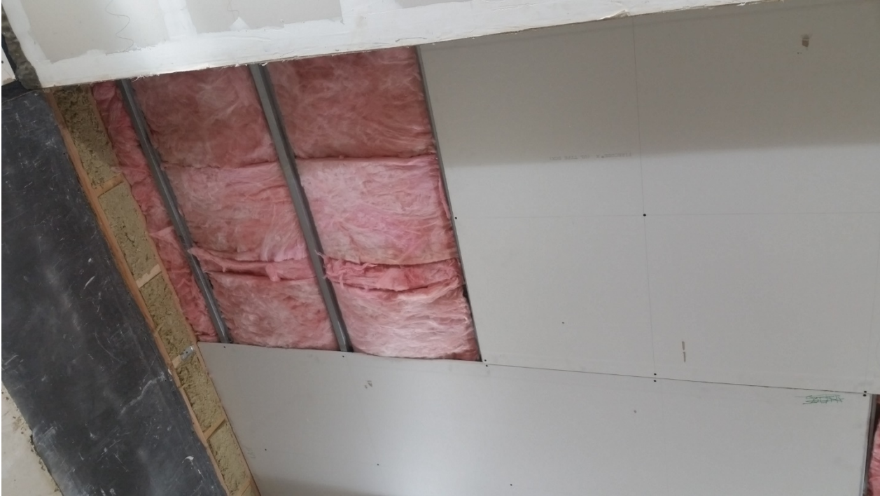
Figure 9 – First layer of gypsum board partially installed to furring channels