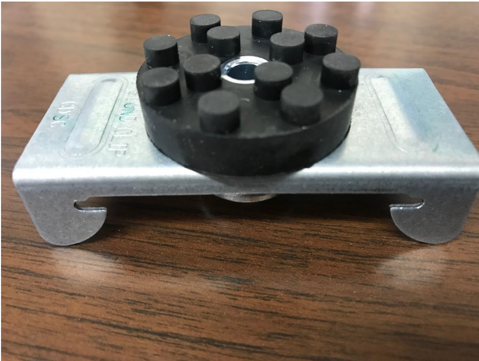
Figure 4 – Detail of isolating clip