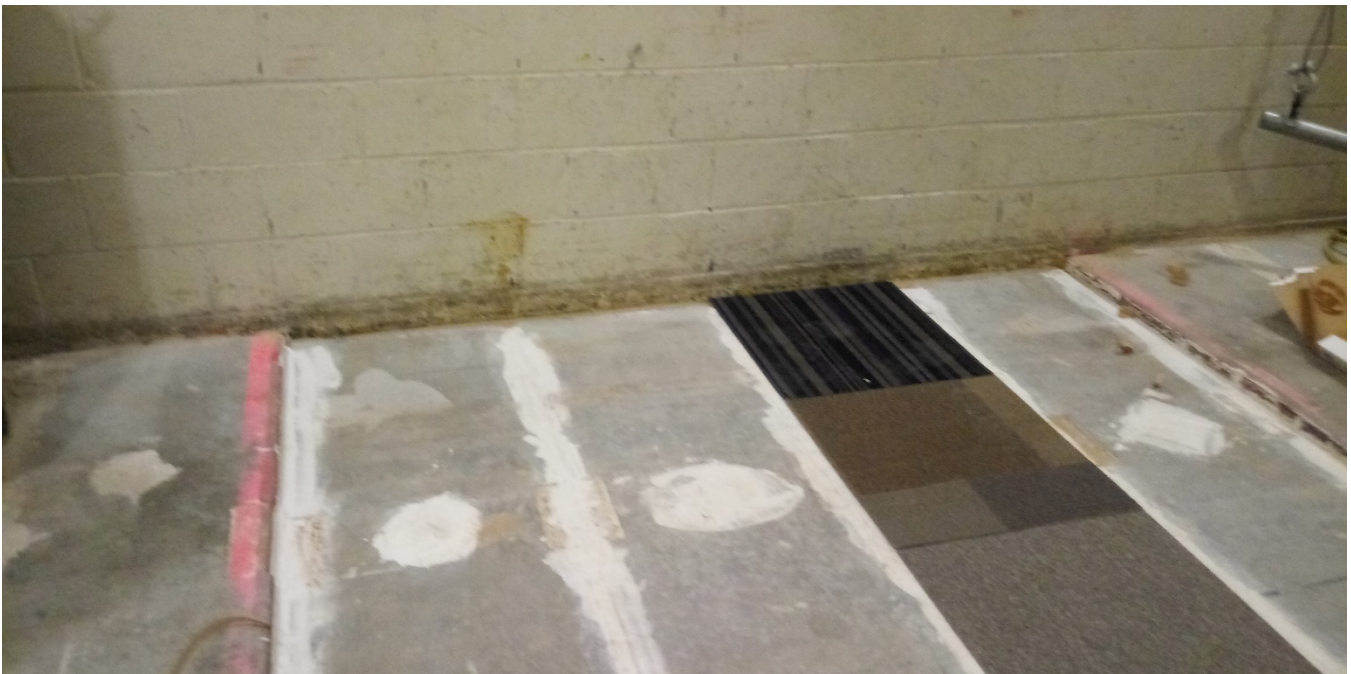
Figure 10 – Carpet tiles partially installed over concrete slabs