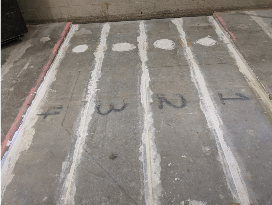
Figure 3 – Concrete slabs prior to installation of carpet flooring, viewed from source room