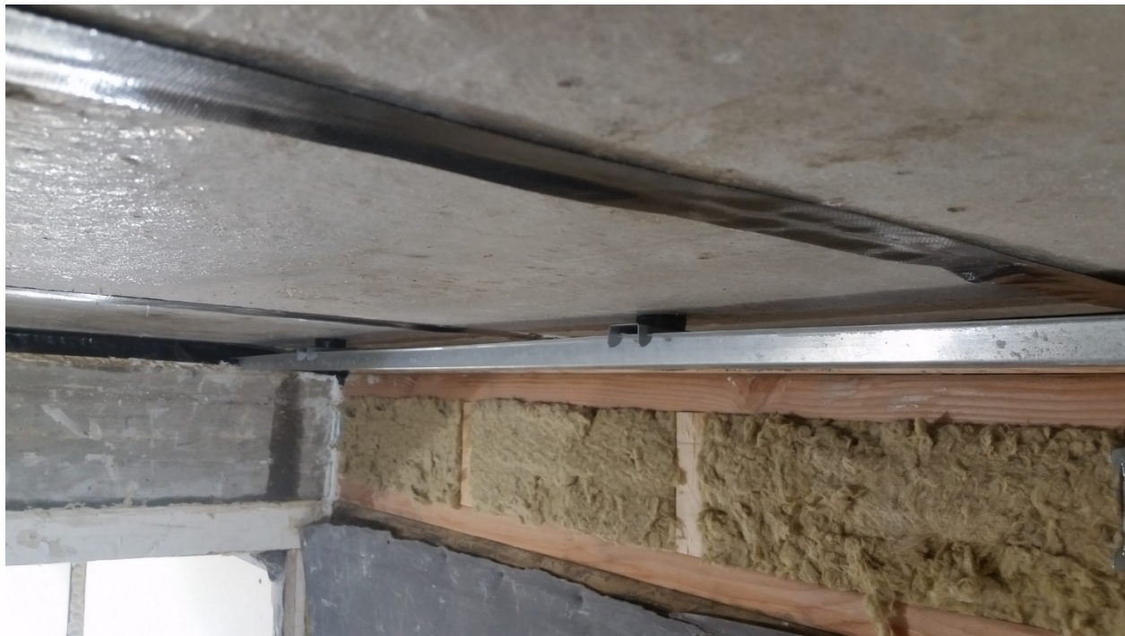
Figure 7 – Furring channel being installed to isolating clips