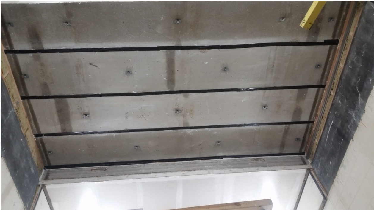
Figure 6 – Isolating clips installed to bottom of concrete slabs