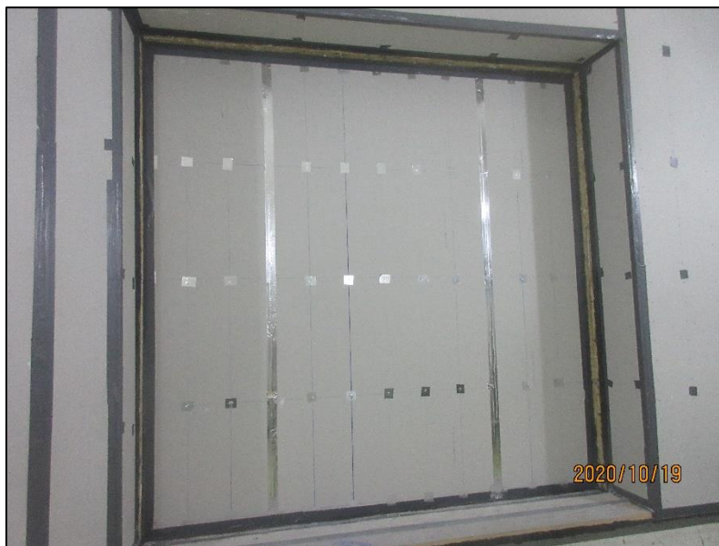
Photo No. 2 Source Room View of Installed Specimen