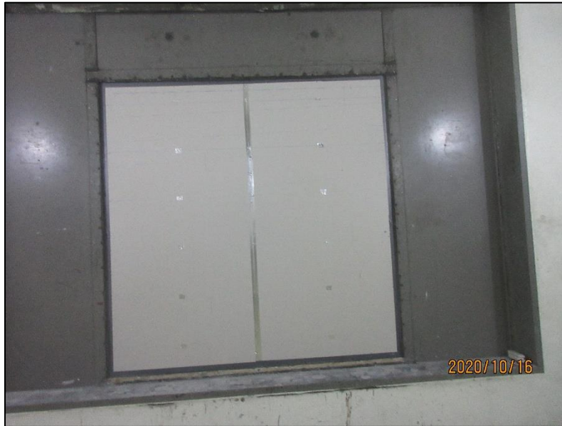
Photo No. 1 Receive Room View of Installed Specimen