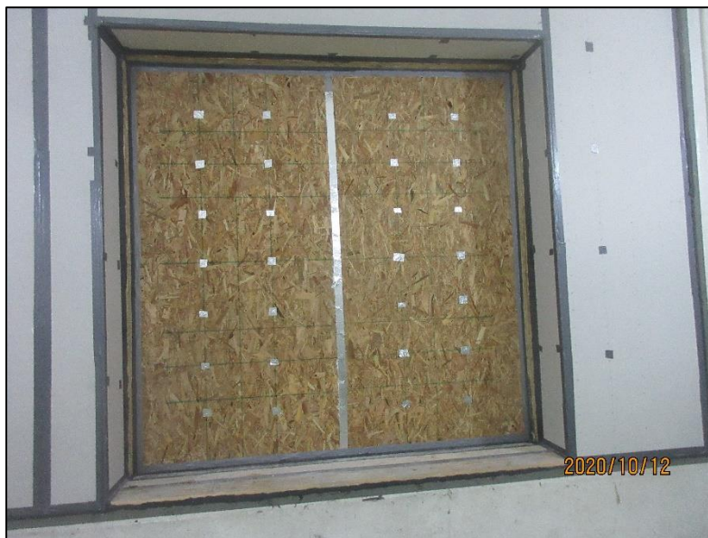
Photo No. 2 Source Room View of Installed Specimen