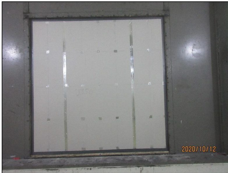
Photo No. 1 Receive Room View of Installed Specimen