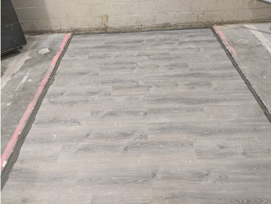
Figure 1 – Specimen mounted in test opening, as viewed from source room