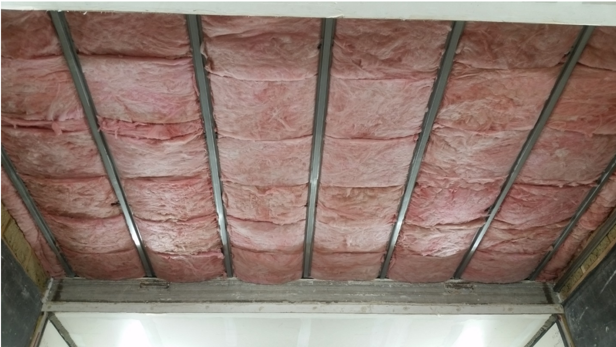
Figure 8 – Furring channel and insulation installed below slabs