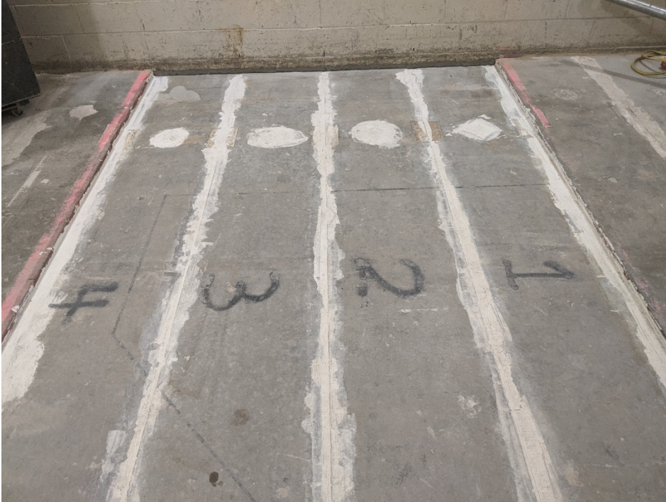
Figure 3 – Concrete slabs prior to installation of flooring, viewed from source room