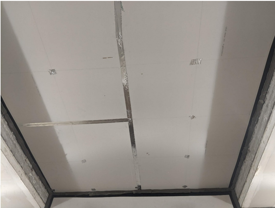
Figure 2 – Specimen mounted in test opening, as viewed from receive room