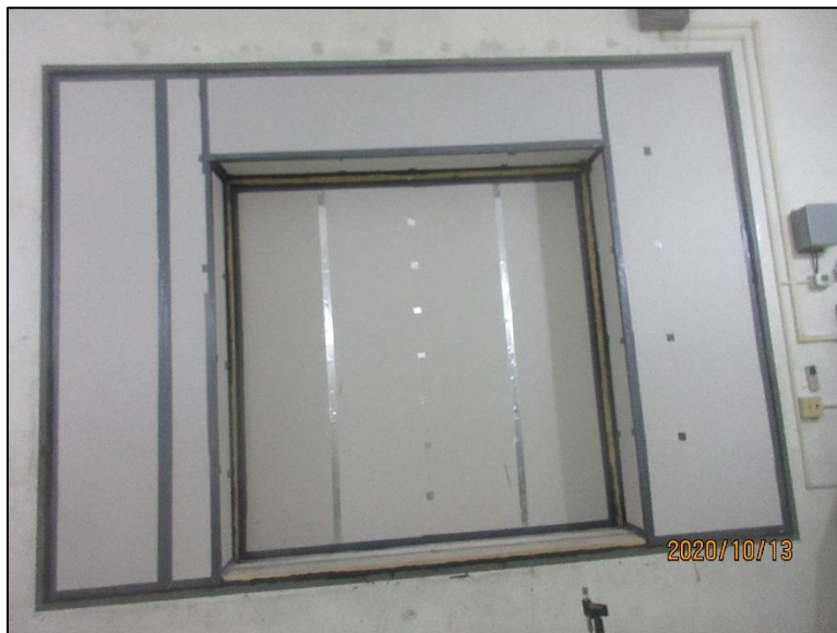
Photo No. 2 Source Room View of Installed Specimen