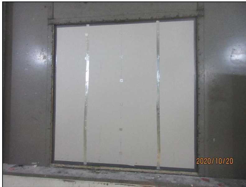
Photo No. 1 Receive Room View of Installed Specimen