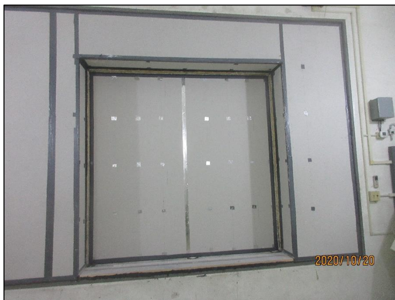
Photo No. 2 Source Room View of Installed Specimen